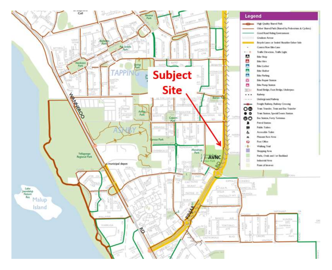
Figure 5. Extract from Perth Bicycle Network map series

Bike access to the site is available via shared paths which are in place along the east side of the subject site and links to the existing network of shared paths and roads classified as "good road riding environment" within the locality. Please refer to Perth's Bicycle Network map illustrated in Figure 5 .