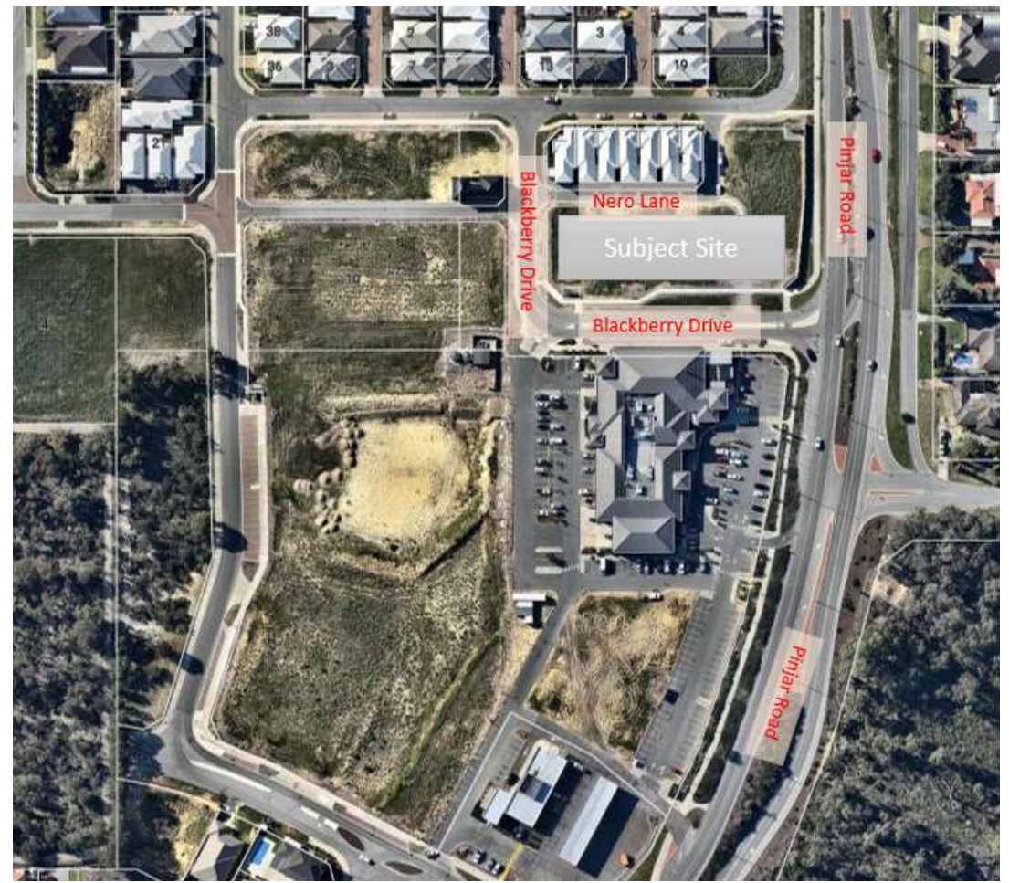
Figure 1: Location of the subject site

The key issues that are addressed in this report include the traffic generation and distribution of the proposed development, parking access and egress, and access to the site for alternative modes of transport.