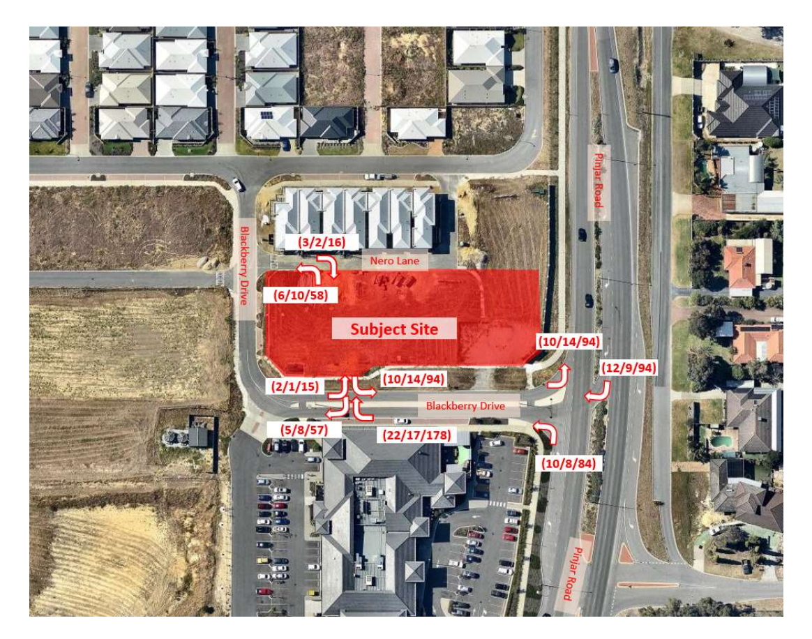
Figure 2. Estimated traffic movements for the proposed development in the peak periods (AM/PM/Daily)

The directional morning, afternoon and total daily trip distribution of the developmentgenerated traffic is illustrated in Figure 2 .