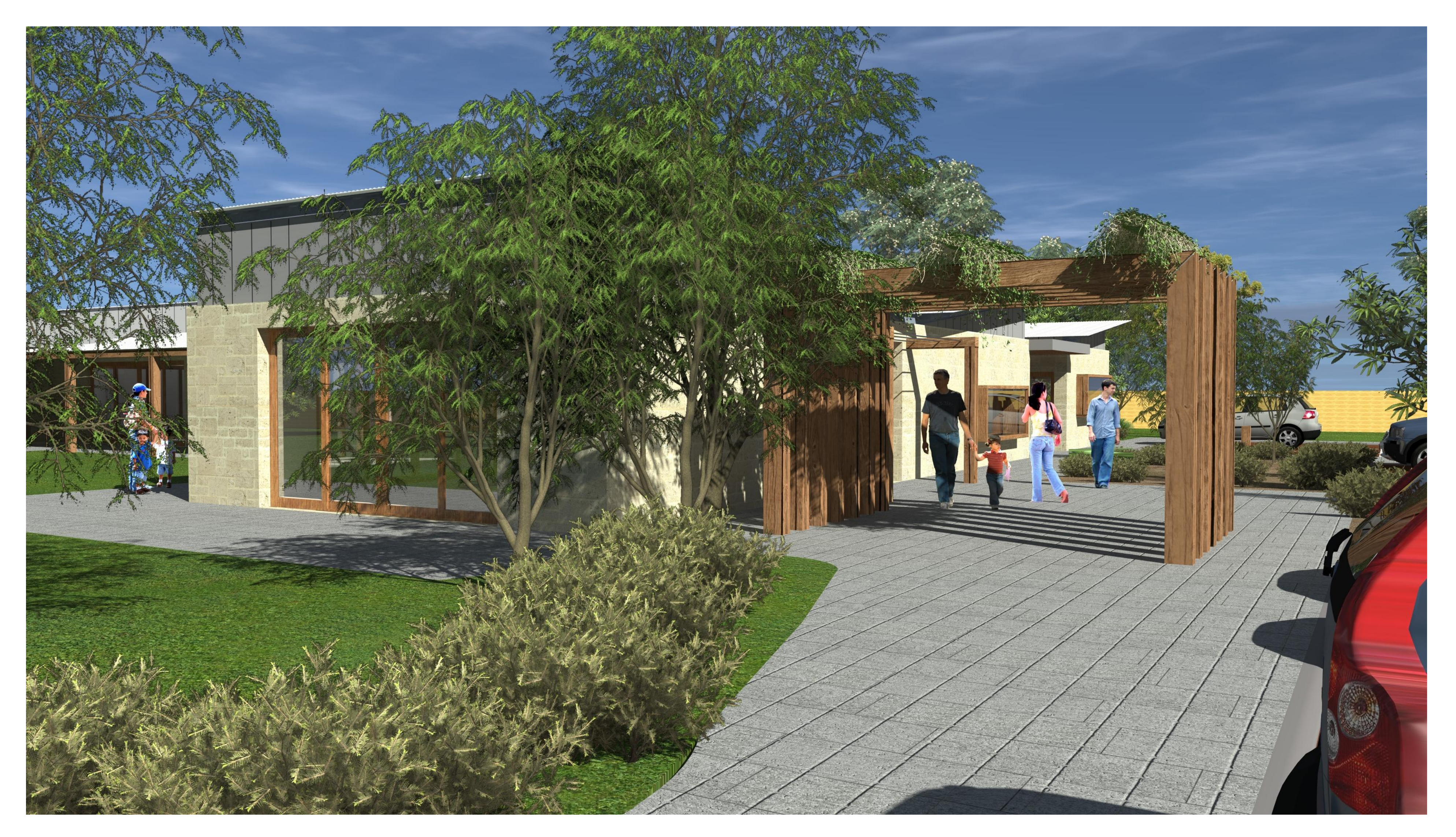
south east pedestrian entry