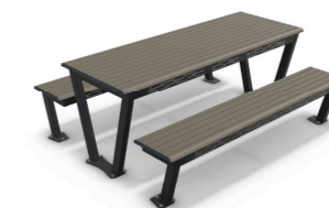
PICNIC TABLE SETTING (OPTIONAL)