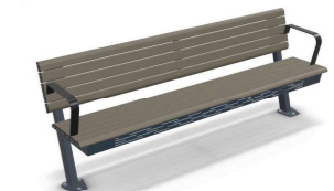
SEAT WITH ARM RESTS