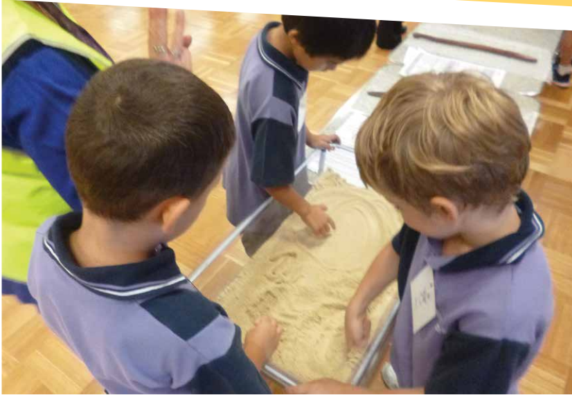
Learning different animal tracks