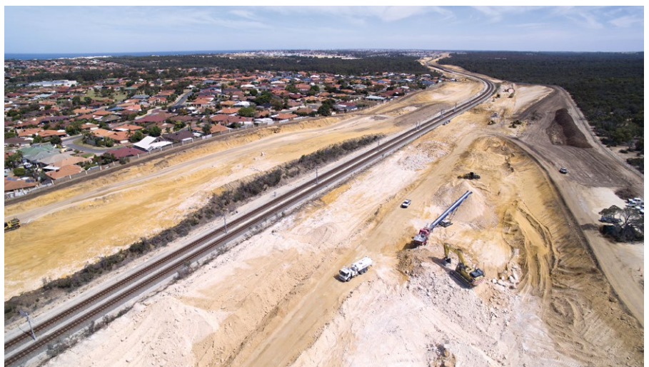
Aerial view of the future freeway alignment looking north from Burns Beach Road.

The equivalent of 700 Olympic size swimming pools of material is expected to be moved by project completion.