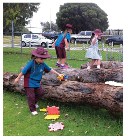
Children from Merriwa Primary School are enjoying playing on the tree logs donated by the project.

Works area generally undertaken Monday to Saturday between 7am and 7pm, with some site maintenance activities undertaken intermittently outside of these times.