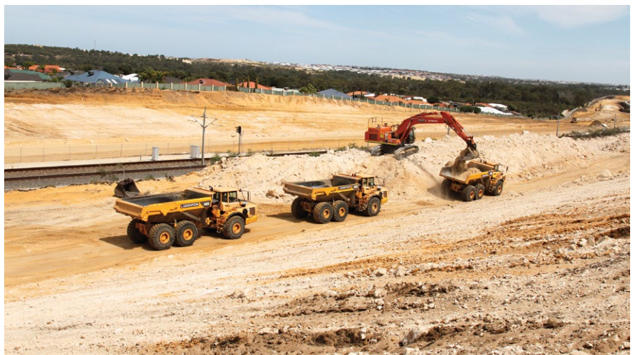
Major earthworks are expected to continue across the project area until mid-2016.