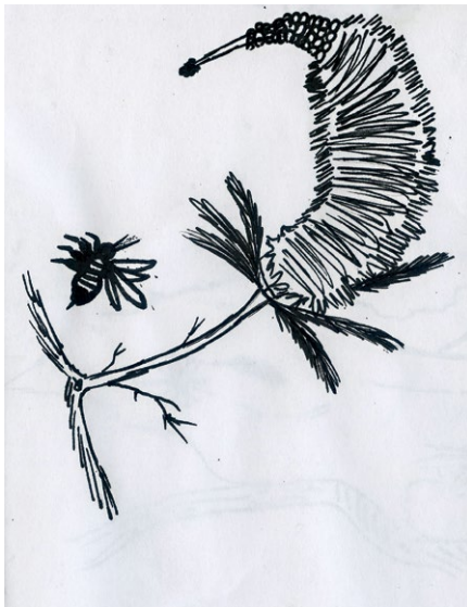
Kinross College students took inspiration from the local environment during their recent workshop.

Artists from Edith Cowan University will develop artwork and paint colour schemes to feature in some of the bridges constructed as part of the project.