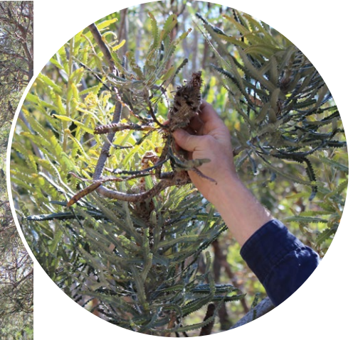
Banksia seed pods have been collected from local bushlands for use in the project's revegetation program.