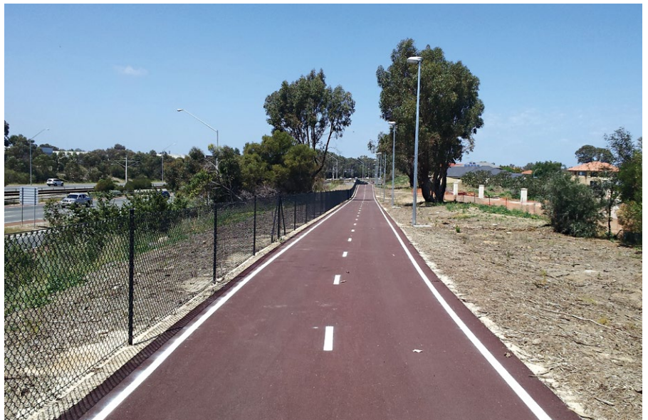
Pedestrians and cyclists will benefit from the extension of the shared path along the freeway.