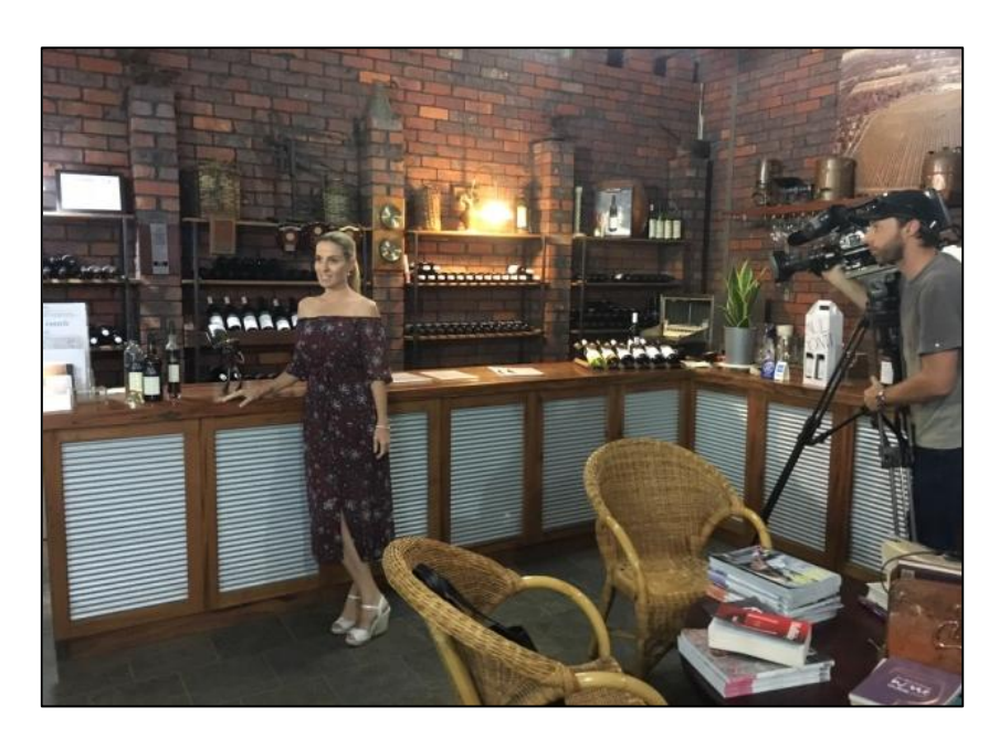
Filming at Conte Estate Winery, Wanneroo

Make sure you're watching WA Weekender on the above dates, at 5.30pm on Channel 7!