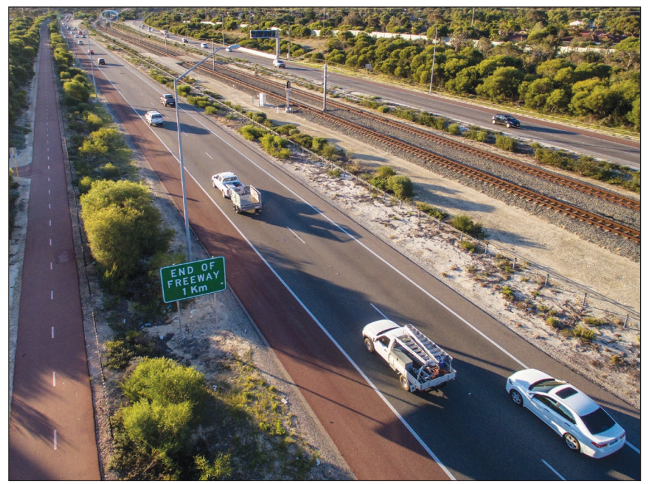
The Mitchell Freeway needs to be extended to Romeo Road.

The state government's recently announced Perth transport plan has left the City of Wanneroo disappointed because the plan lacks clear delivery timeframes.