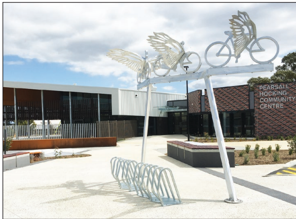
The new Pearsall/Hocking Community Centre is set to open this month.

The Pearsall/Hocking Community Centre is just days away from completion, set to be open to the public later this week (13 October).