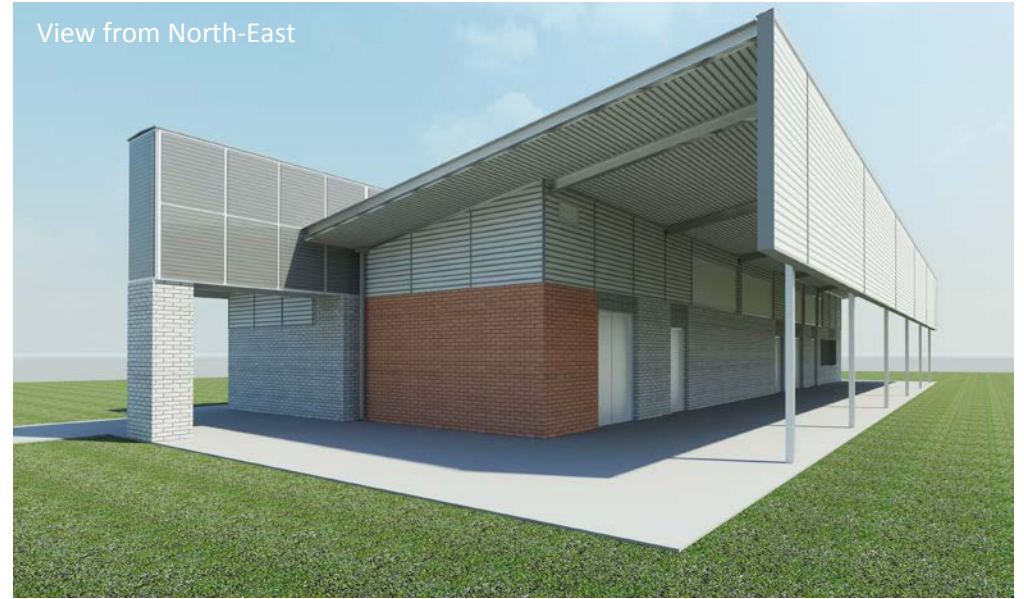
View from North-East