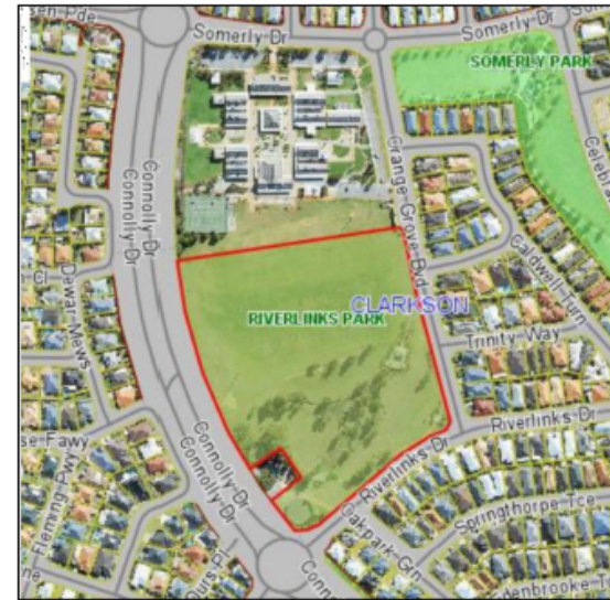
LOCATION PLAN NOT TO SCALE