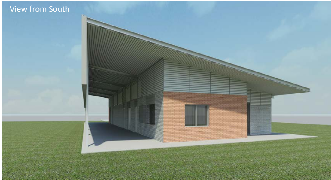
View from South