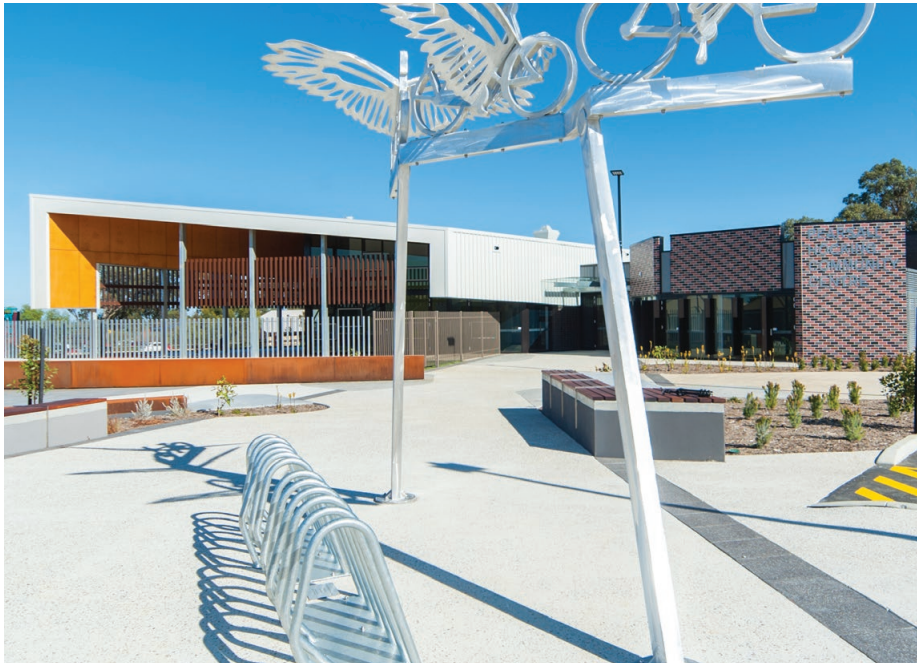
Pearsall Hocking Community Centre.

The Pearsall Hocking Community Centre will be officially opened this Saturday with a family fun day to mark the occasion.