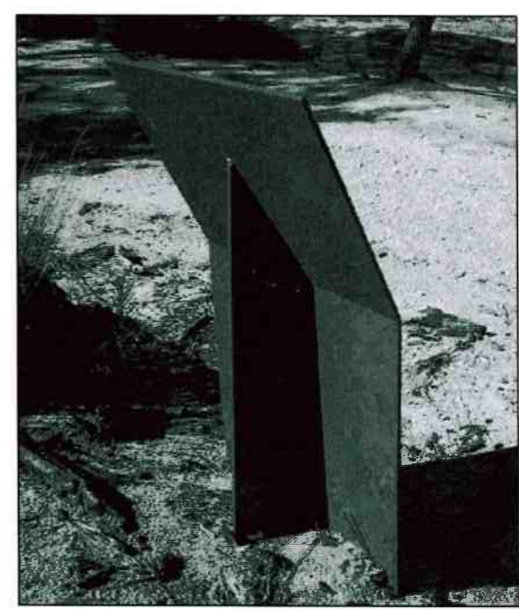
3D VIEW (DIAGRAMATIC ONLY)