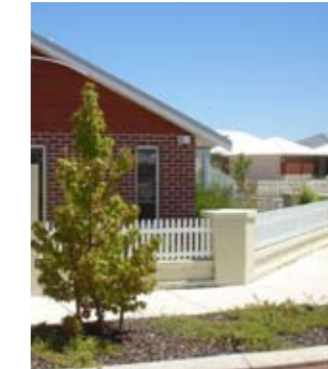
Indicative of laneway fencing