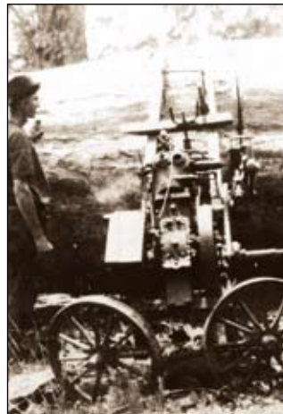
WA's first power saw, using a car engine for the motor.

The natural bushland of the Wanneroo area led to the formation of a timber industry. In 1921 the Dennis family set up one of the first saw mills in Wanneroo near Lake Mariginiup. This saw mill cut seven-inch (18cm) blocks for use on the road from Wanneroo to Yankeep. The Dennis family also produced the first power saw in Western Australia, using a car engine for the motor. The Villanovas operated the 'Pinjar Saw Mill' until the 1960s.