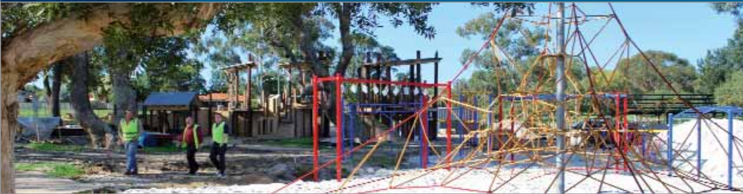
CHILDREN'S INNOVATIVE PLAYSACE