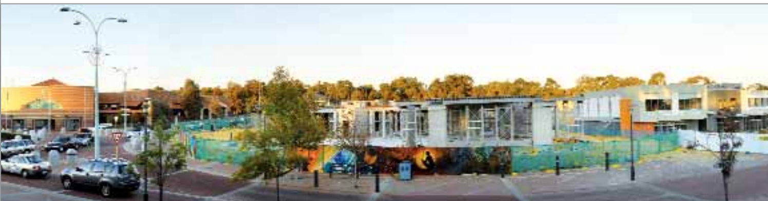
WANNEROO LIBRARY AND CULTURAL CENTRE