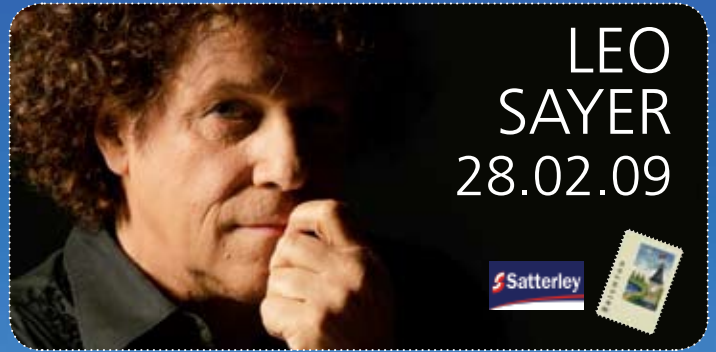
LEO SAYER 28.02.09

Liddell Reserve, corner Beach and Wanneroo Roads, Girrawheen.