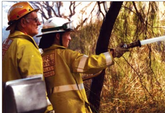
Wanneroo Volunteer Bush Fire Brigade volunteers in action during a controlled burn off.

For more information or to register your interest, contact the City of Wanneroo on 9405 5000 or visit the City's website for a nomination form. www.wanneroo.wa.gov.au