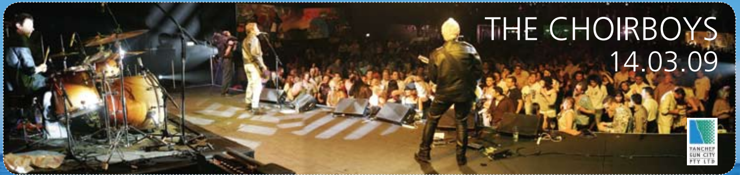
THE CHOIRBOYS 14.03.09

Kingsbridge Park, corner Kingsbridge Boulevard and Connolly Drive, Butler.