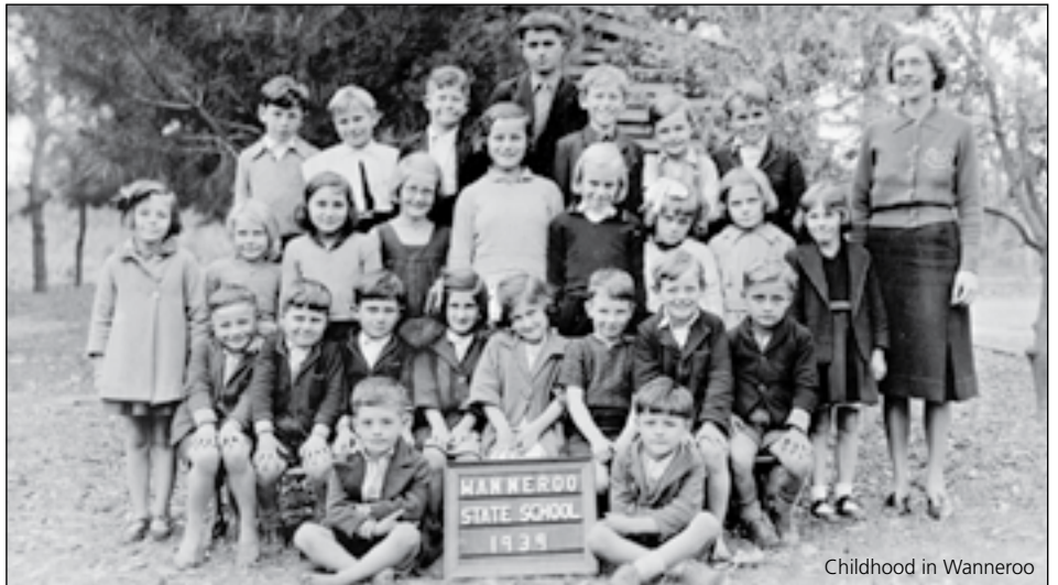
Childhood in Wanneroo