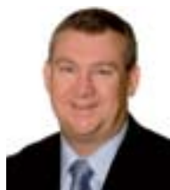
JON KELLY MAYOR