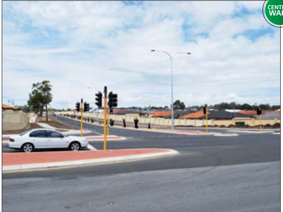
The new realigned section of Pinjar Road and Wanneroo Road.

The improvements will reduce vehicle queue lengths on Dundebur Road at the traffic