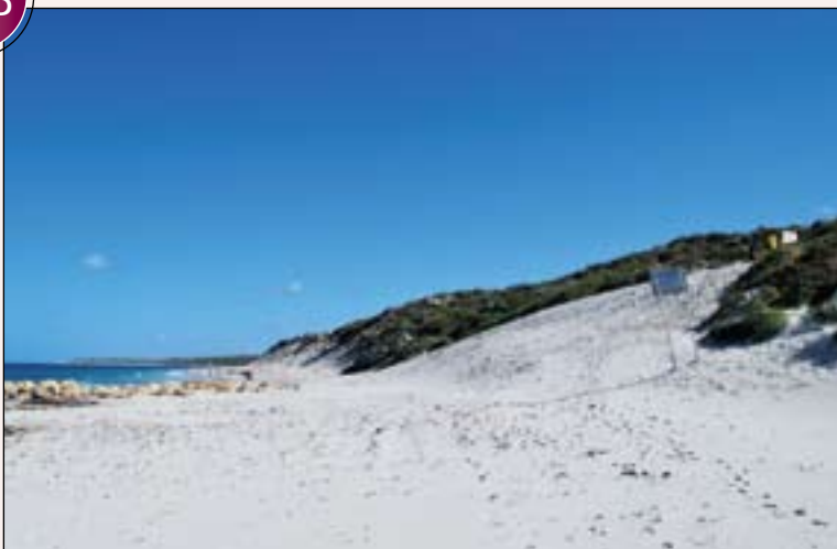
The Camira Way groyne beach access, Quinns Rocks will be built at this location.