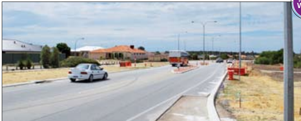
Joondalup Drive roadworks between St Stephens Crescent and Tumbleweed Drive.

There will be realigned second carriageway connections to the roundabouts at Pinjar Road and Tumbleweed Drive, and the Rawlinna Parkway access will be modified.