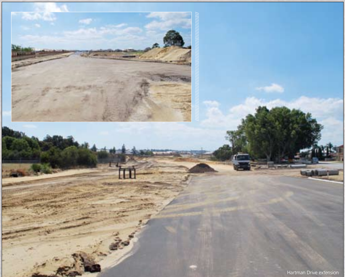
Hartman Drive extension