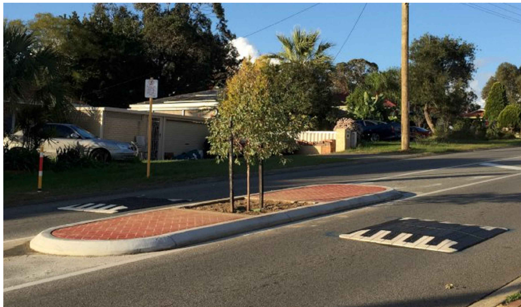
2x SPEED CUSHIONS & ISLAND ARRANGEMENT DETAIL 1