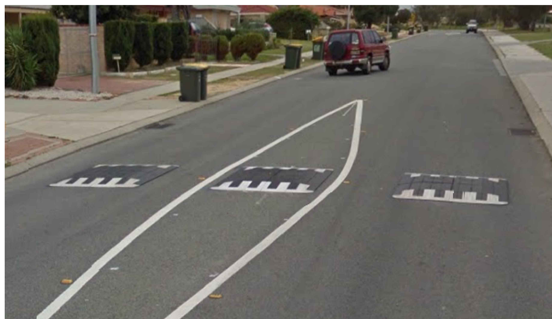
3x SPEED CUSHION ARRANGEMENT DETAIL 2