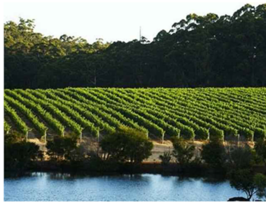
Inspired by the vineyard landscape