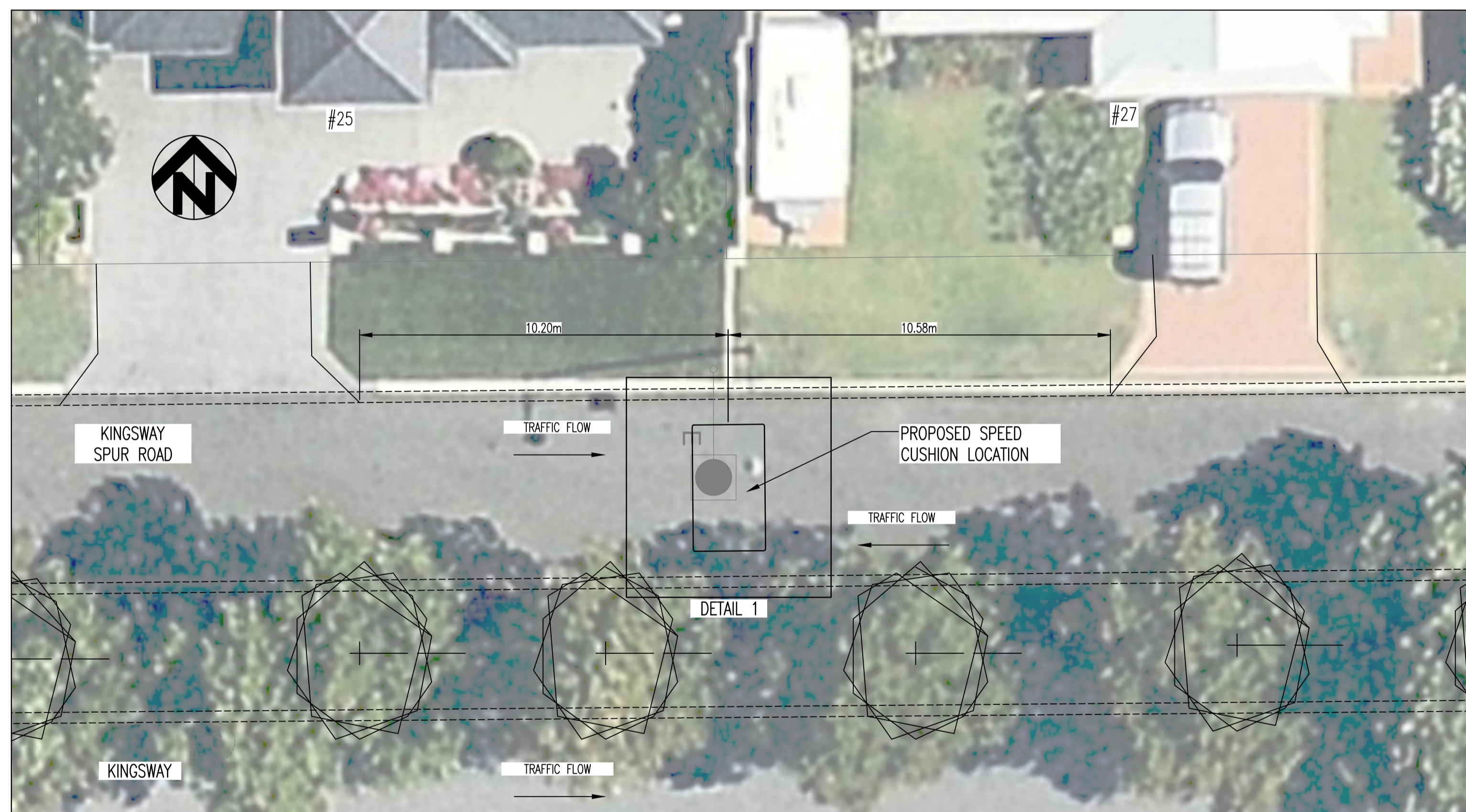
AERIAL PHOTO INCLUDING CUSHION LOCATION