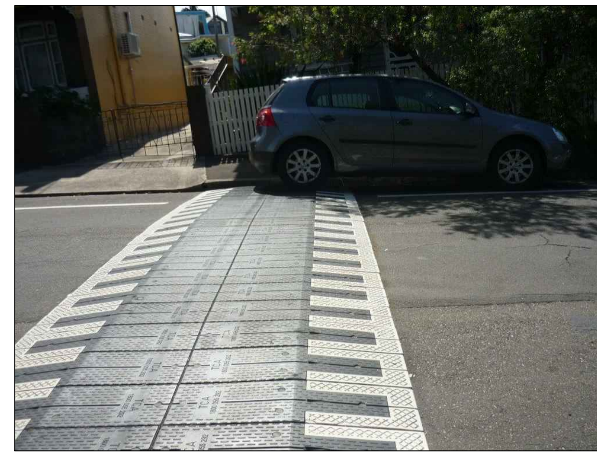
IN-SITU EXAMPLE (NTS)