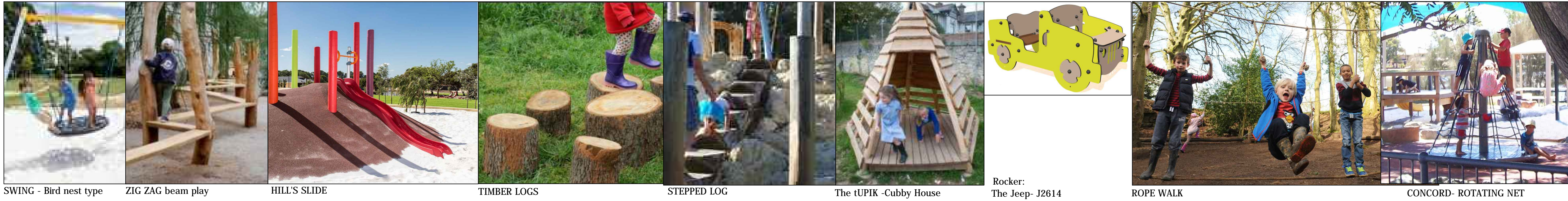
SWING - Bird nest type ZIG ZAG beam play HILL'S SLIDE TIMBER LOGS STEPPED LOG The TUPEK - Cubby House Rocker: The Jeep- J2614 ROPE WALK CONCORD- ROTATING NET