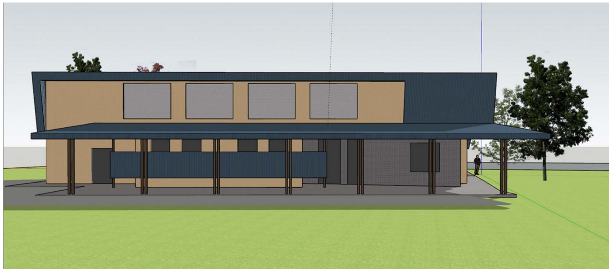
PERSPECTIVE VIEW FROM OVAL (NORTH)