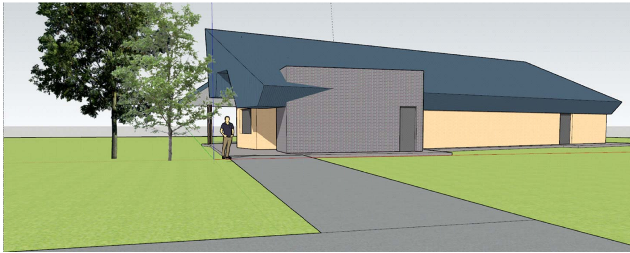
PERSPECTIVE VIEW FROM CARPARK (SOUTH)