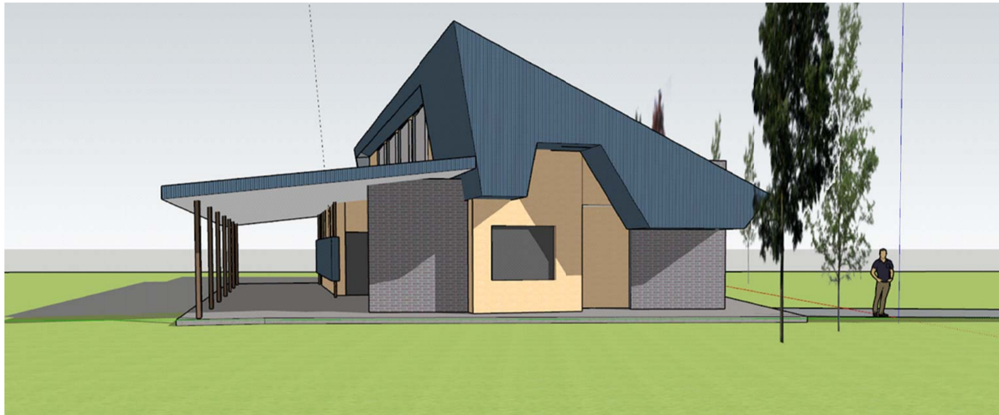
PERSPECTIVE VIEW OF THE WESTERN ELEVATION