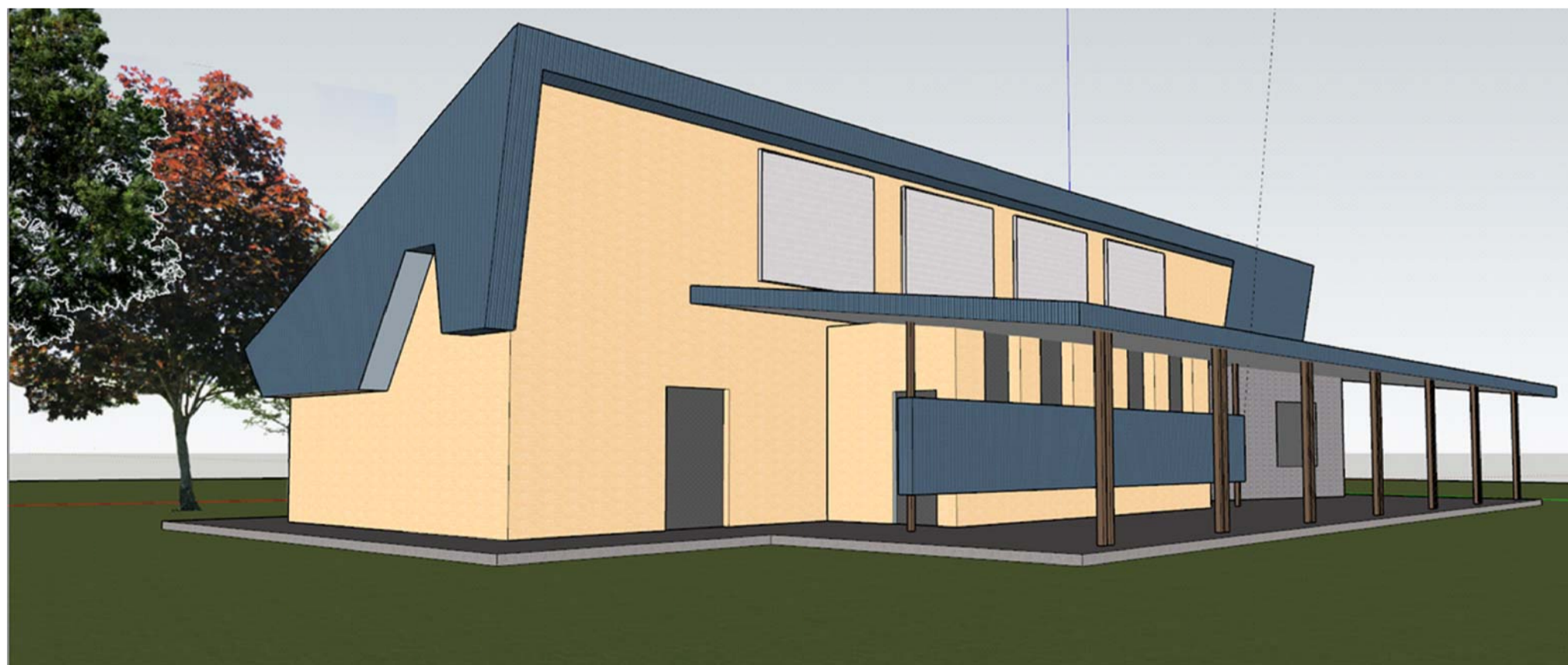
PERSPECTIVE VIEW OF THE EASTERN ELEVATION