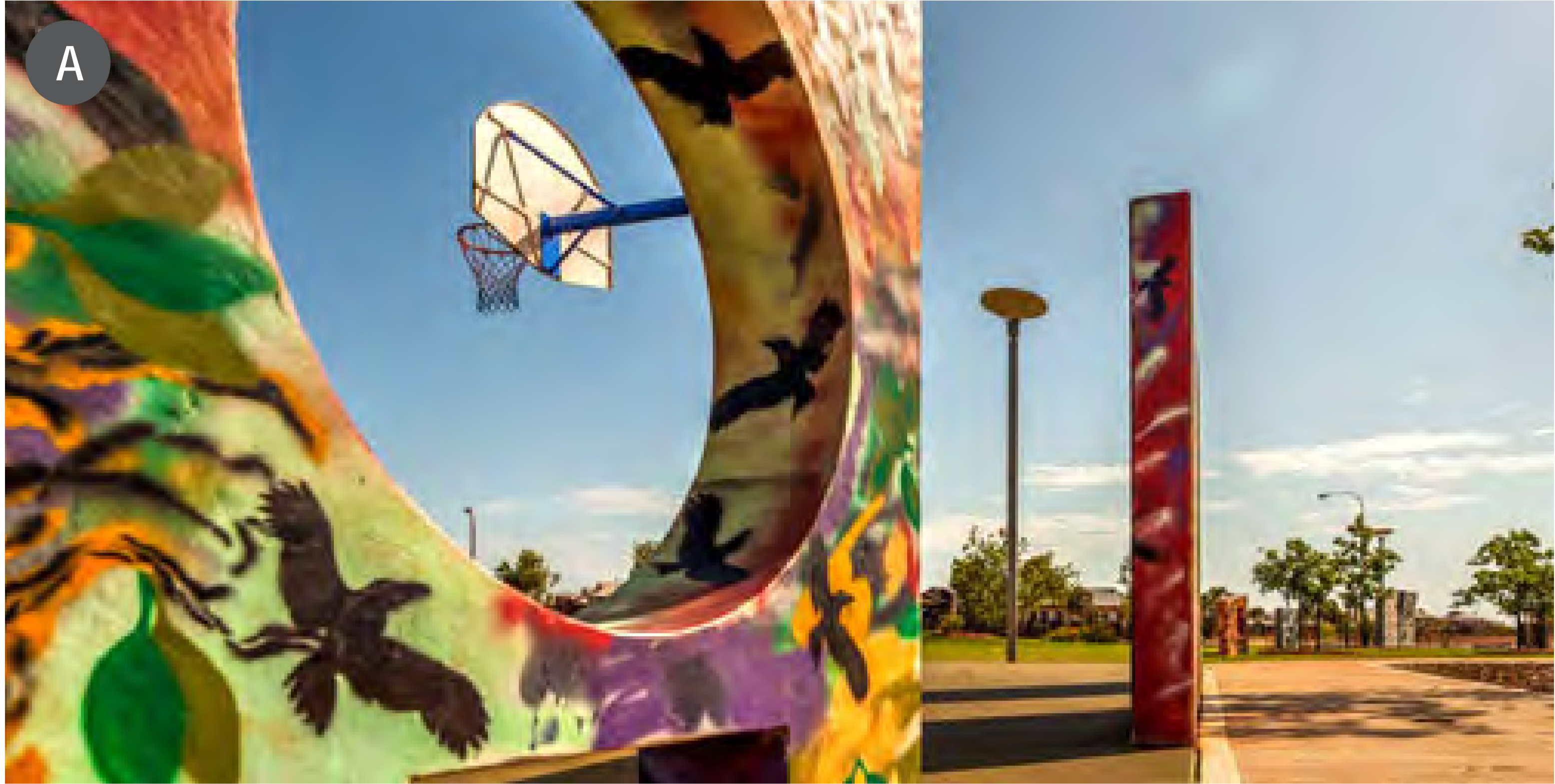
A Potential to incorporate art into basketball court