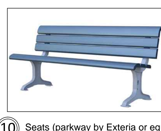
10 Seats (parkway by Exteria or equal)

PLEASE NOTE: Layout, materials and areas on this drawing are indicative only for the purposes of consultation. Final layout and materials shall be determined at documentation stage.