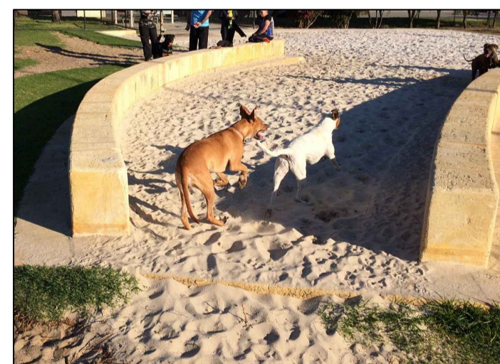
7 Dog sand play area with limestone seating