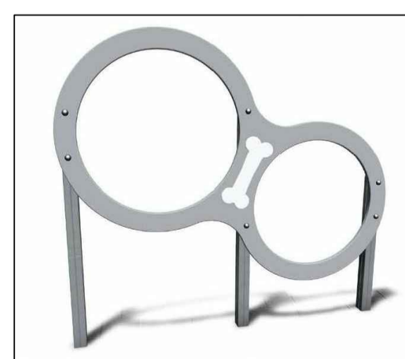
4 Dog agility : Hoop (Willplay or equal )