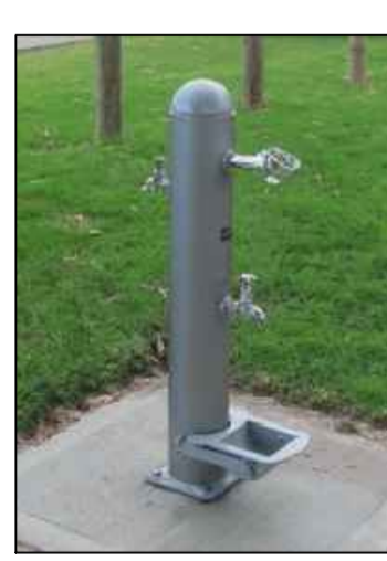
6 Drinking fountain in 1.2m square concrete pad with drainage channel and soakwell