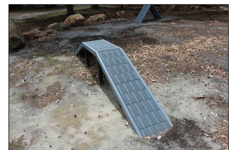
2 Dog agility : Bridge (Replas or equal )