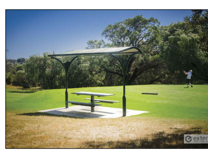
8 New picnic table and shelter to match existing (montego by Exteria or equal). New and existing shelter shall have security lighting subject to power availability and funding.