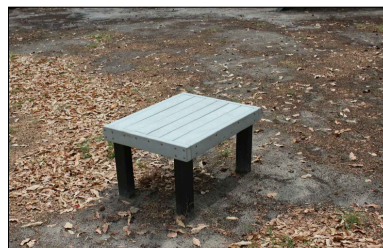
5 Dog agility : Sit stay (Replas or equal )