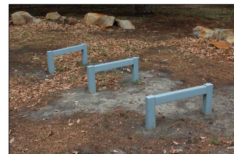
1 Dog agility : Triple hurdles (Replas or equal ) a. 250mm high b. 400mm high