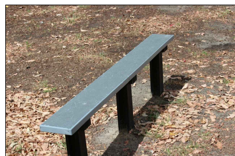
3 Dog agility : Balance beam (Replas or equal )