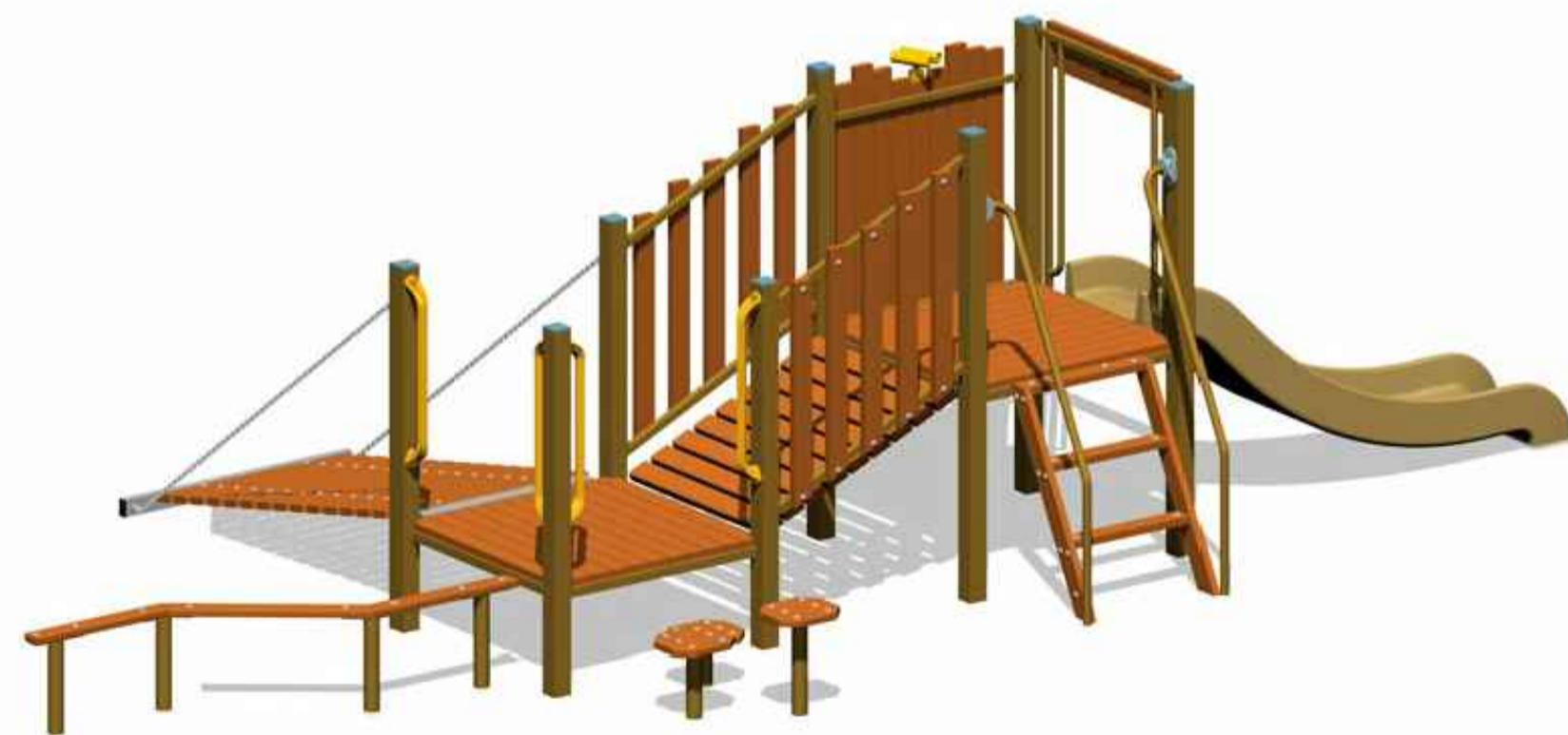
SMALL COMBINATION UNIT