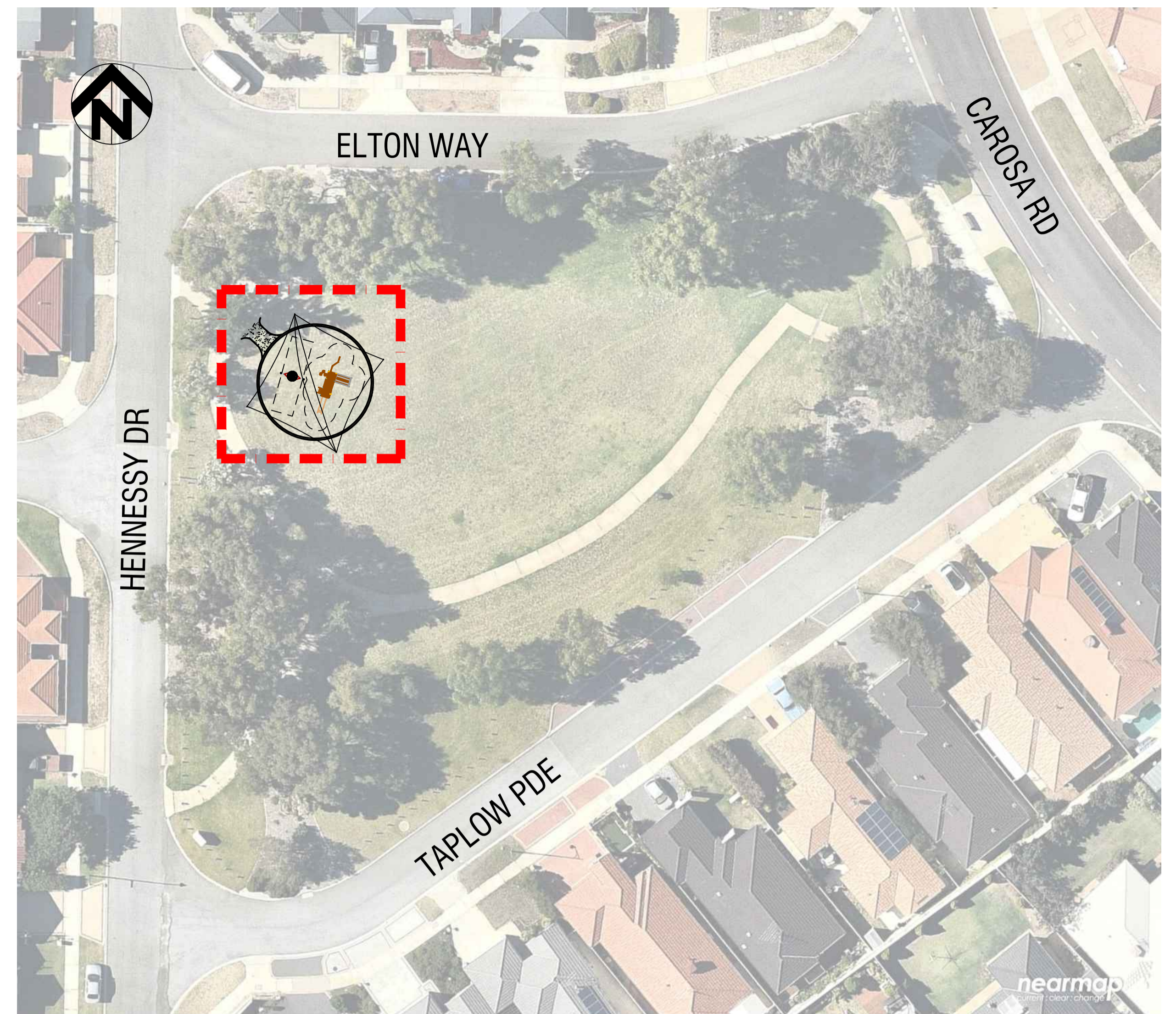
02 LOCATION PLAN SCALE NOT TO SCALE