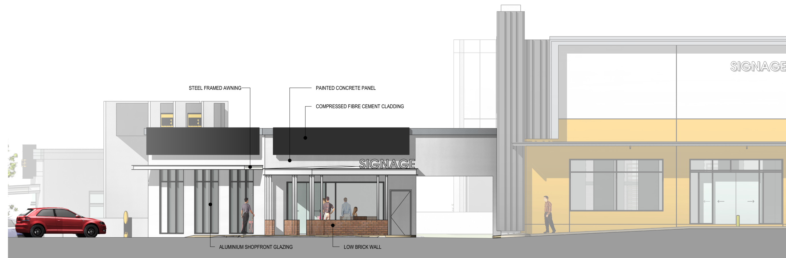
2 EAST ELEVATION SK64 1 : 100