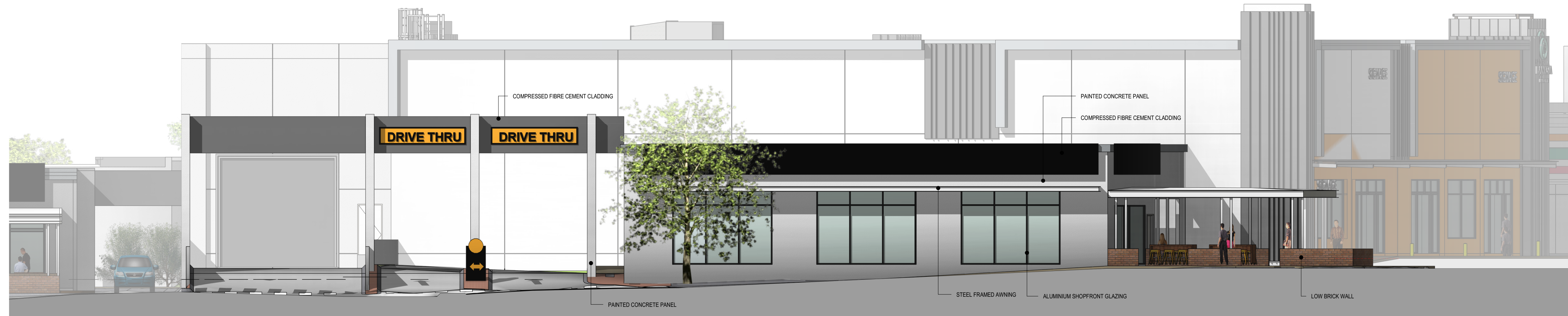
1 SOUTH ELEVATION SK64 1 : 100