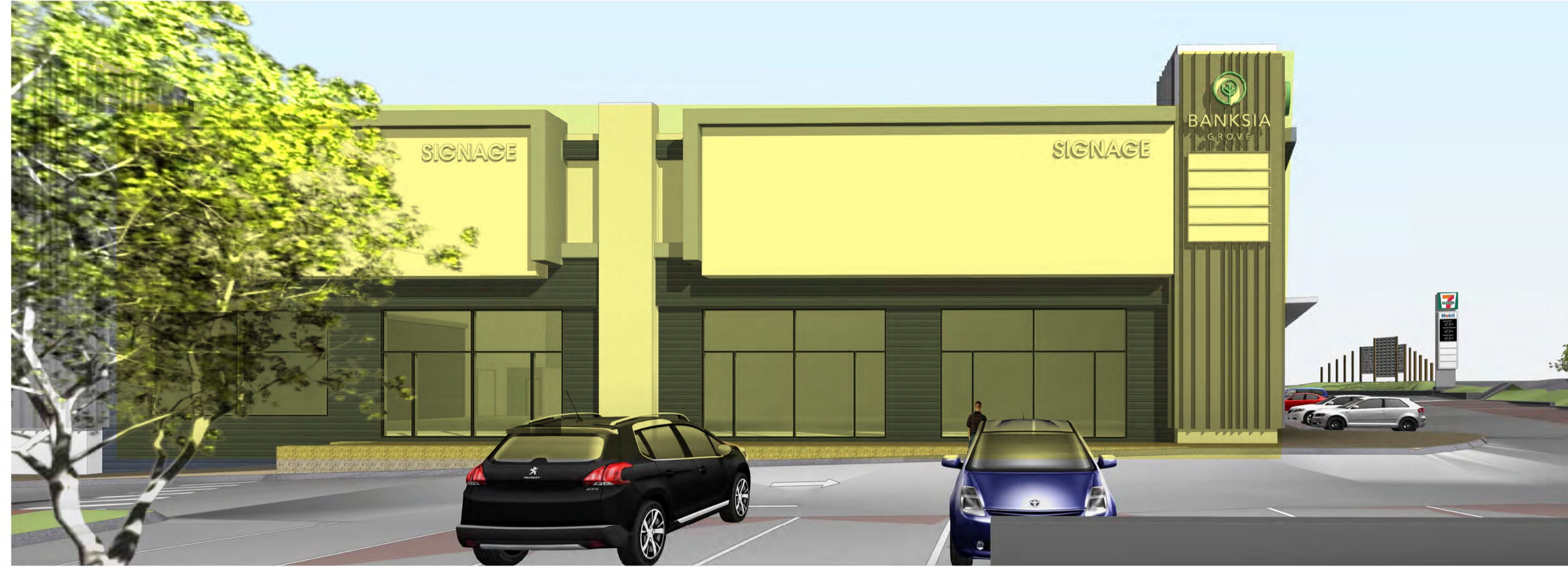
1 VIEW FROM SOUTH

Previously approved Showroom #3, Storage Room subject to modifications