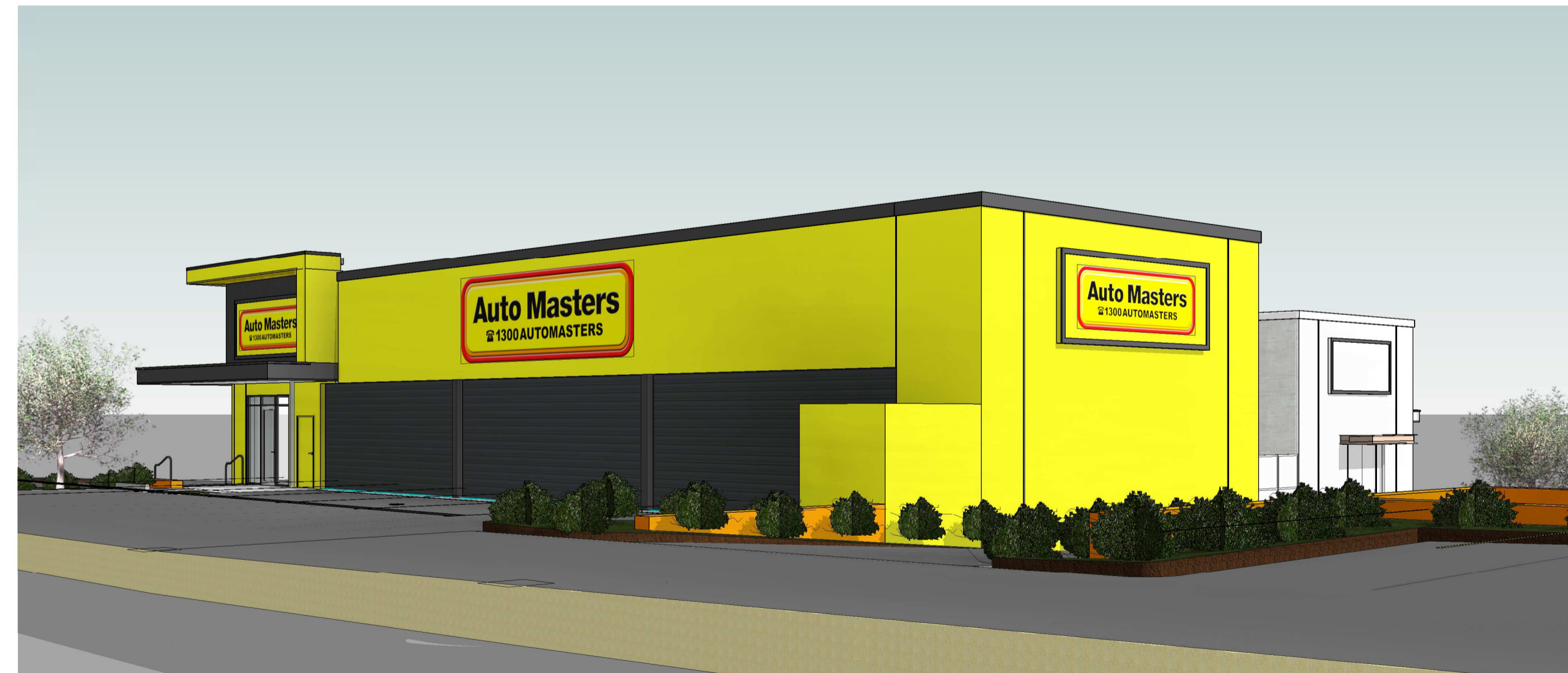
4 BUILDING A NORTH EAST SCALE:

© Oldfield Knott Architects Pty Ltd. 2015 | www.oldfieldknott.com.au