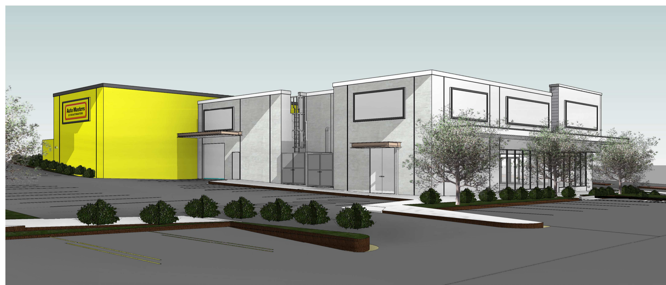
3 BUILDING A NORTH WEST SCALE: