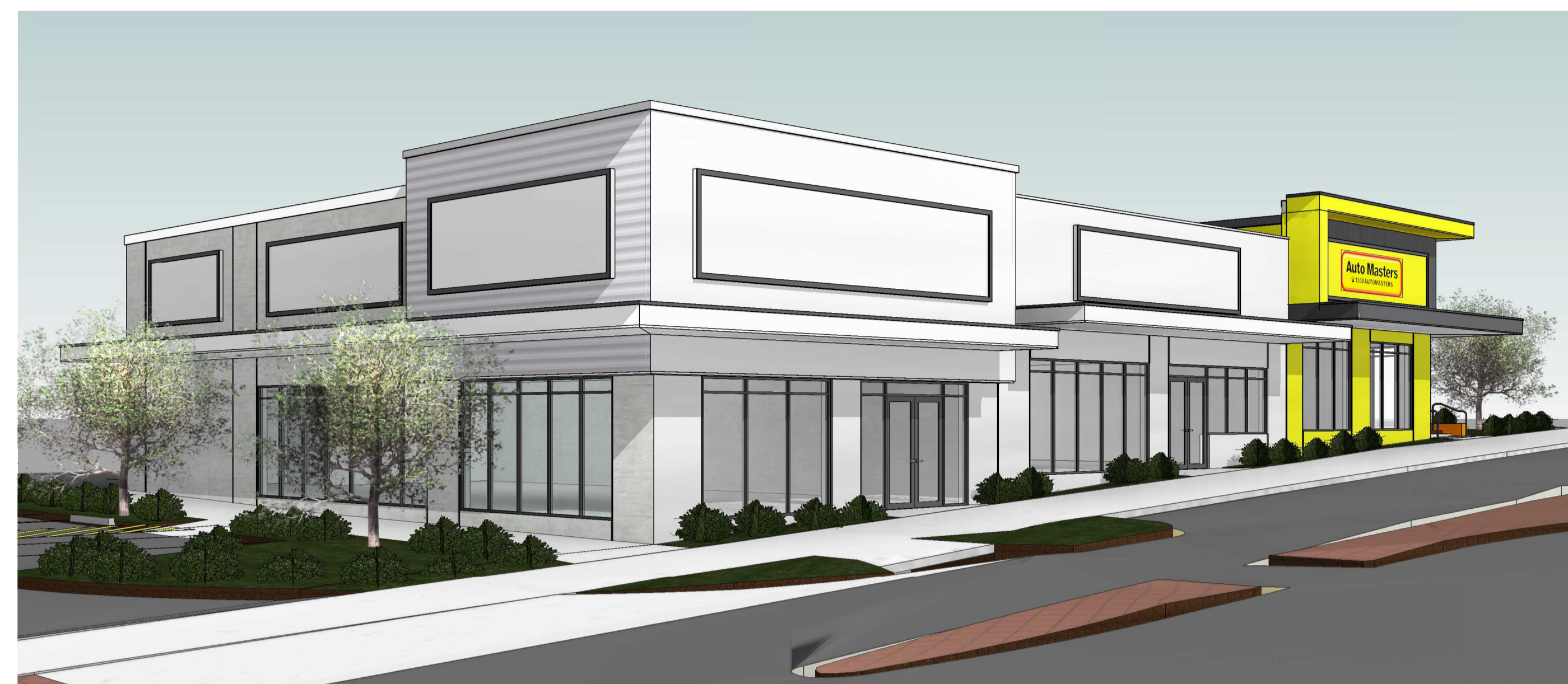
2 BUILDING A SOUTH WEST SCALE: