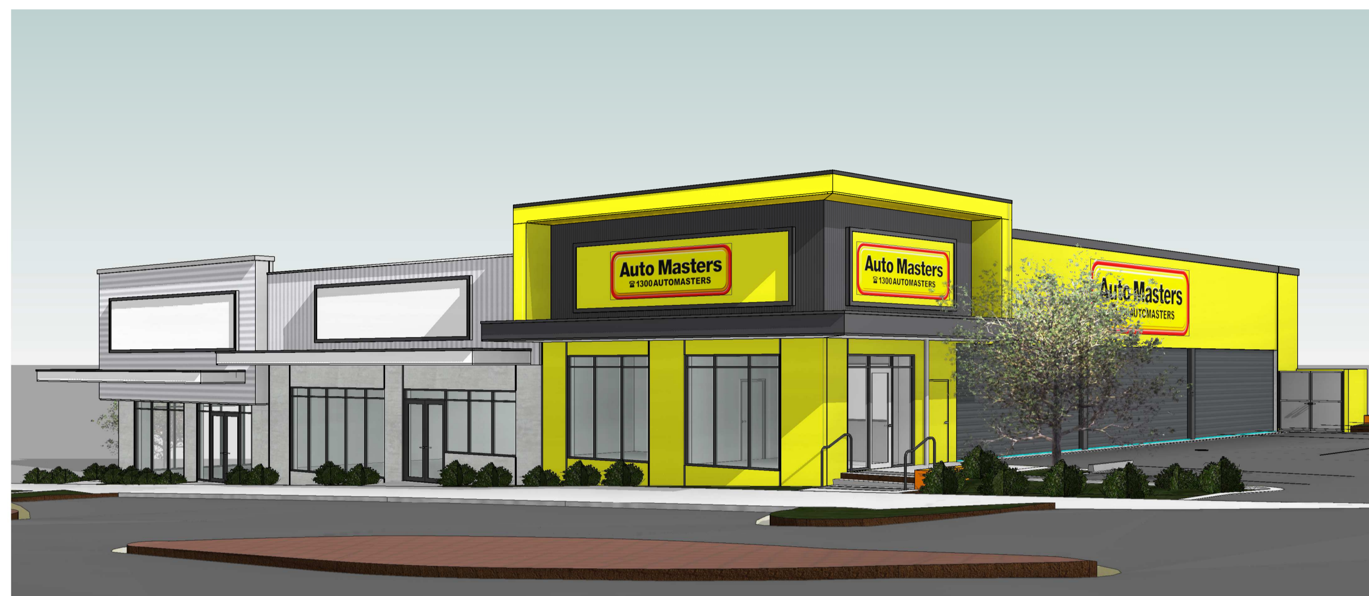
1 BUILDING A SOUTH EAST SCALE: