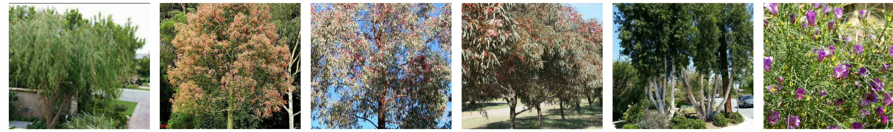
Agonis flexuosa 'Lemon & Lime' (AF) Brachycton acerifolia x populneus (BA) Eucalyptus sideroxylon rosea (ES) Eucalyptus torquata (ET) Melaleuca quinquenaria (MQ) Alyogyne hakeifolia (Ah)