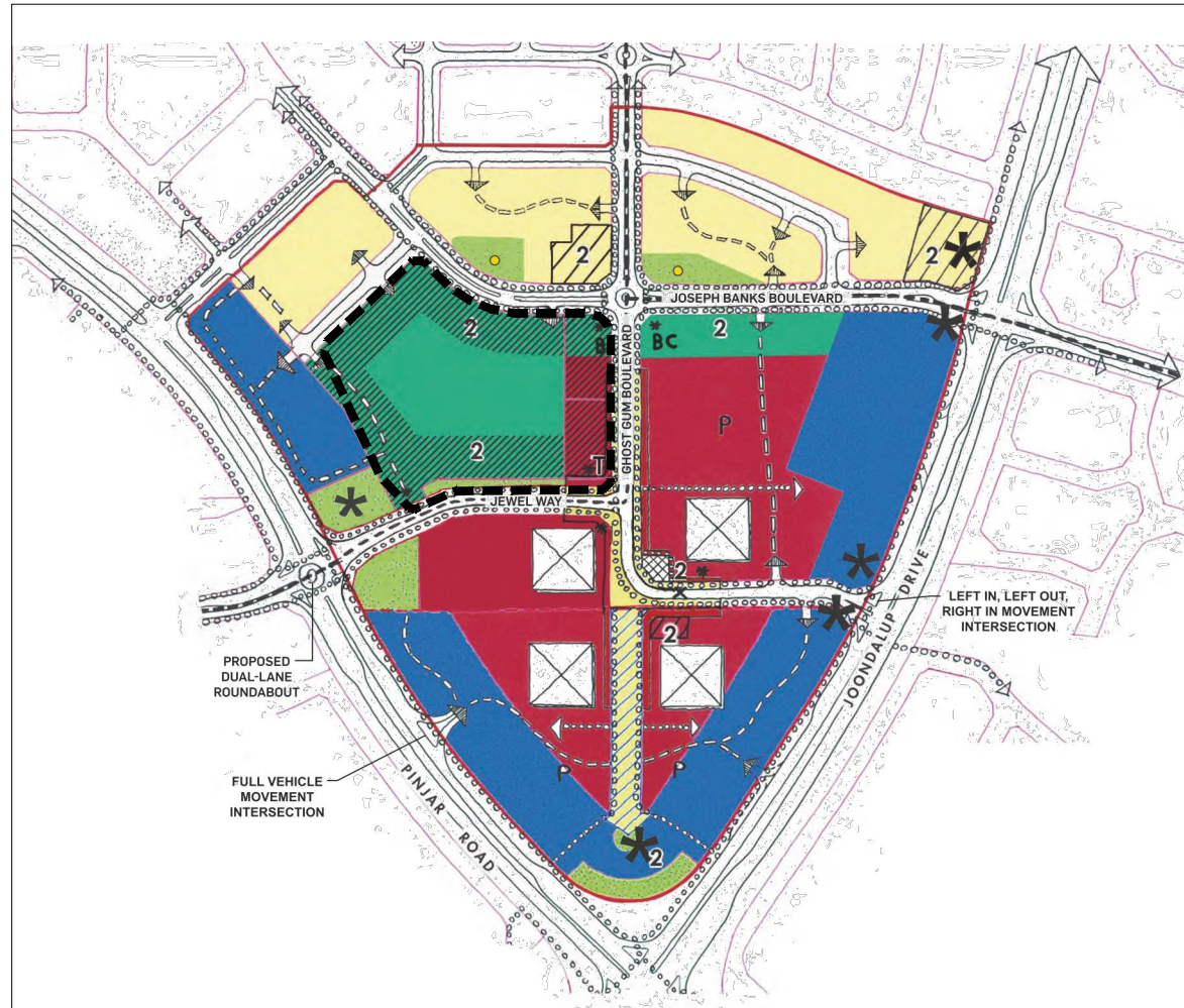
CURRENT ACP No. 65