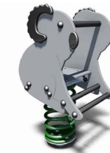
3 KOALA SPRING UNIT