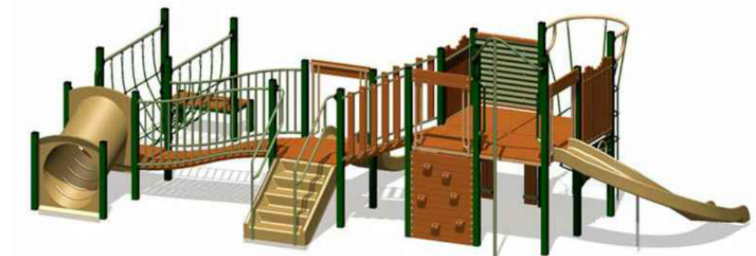
5 COMBINATION UNIT