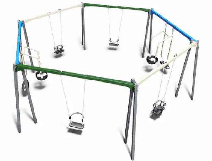
2 6-WAY TOUCH SWING WITH FACE TO FACE PARENT/CHILD SEATS