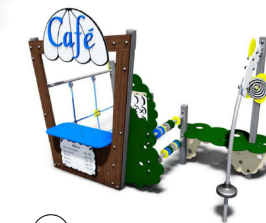
5 CAFE PLAY UNIT