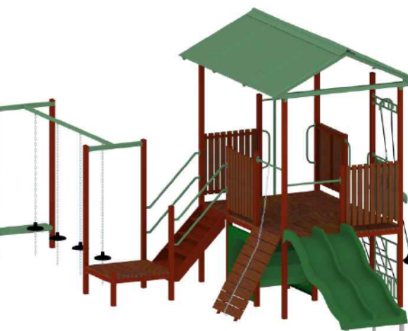
5 SMALL PLAY UNIT WITH SAND PLAY