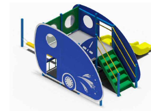
6 SMALL PLAY UNIT