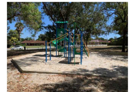
4 EXISTING PLAY UNIT - SAND REPLACED WITH RUBBER SOFTFALL