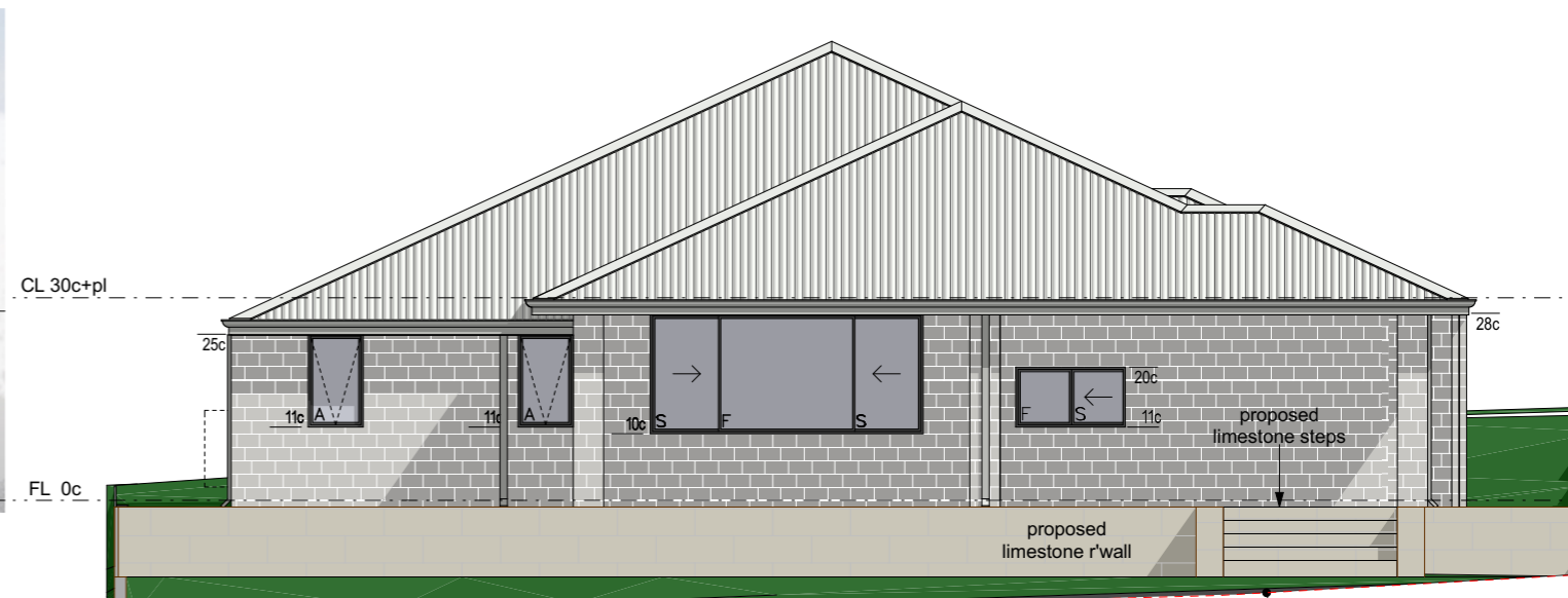
E3 Rear Elevation 1:100