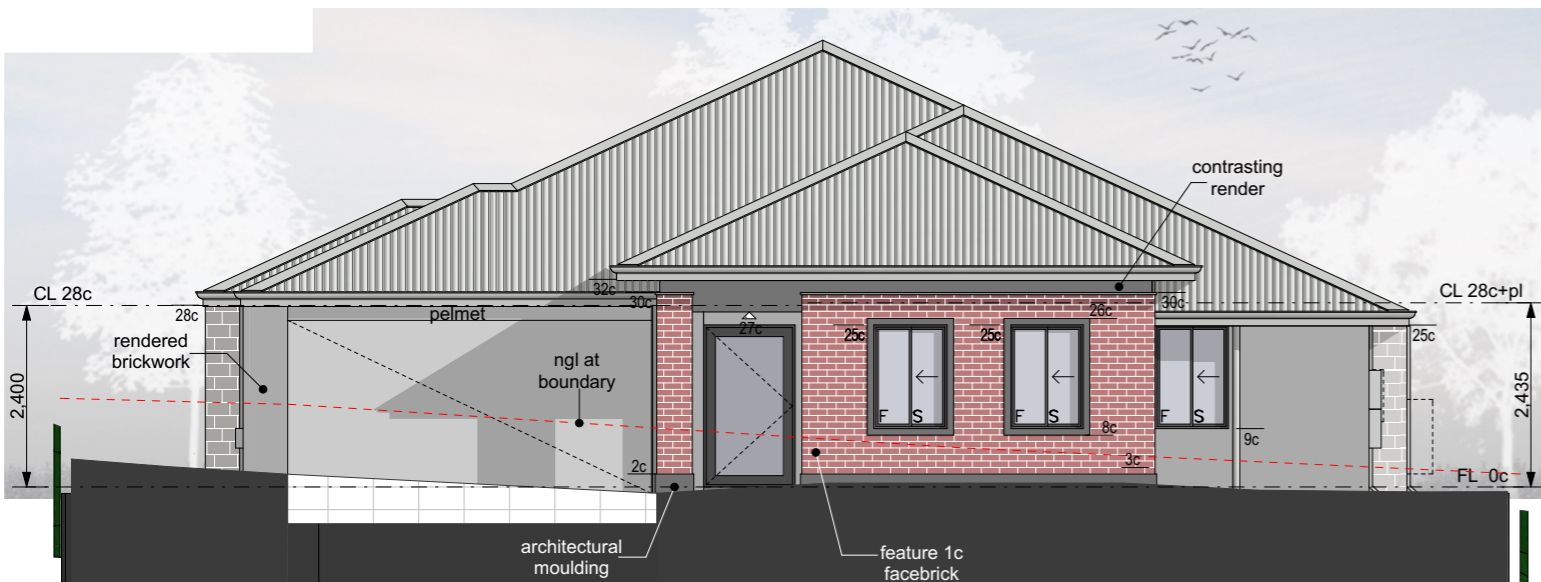
E1 Front Elevation 1:100