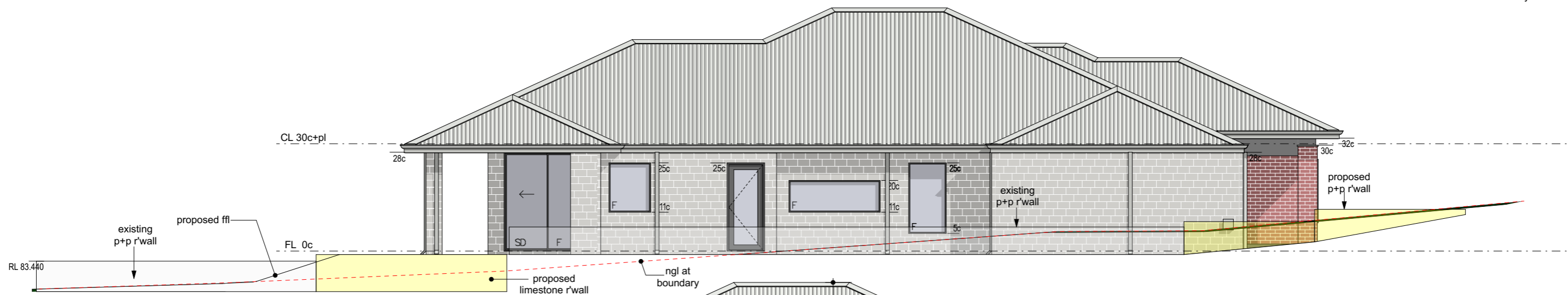
E2 Side Elevation 1:100