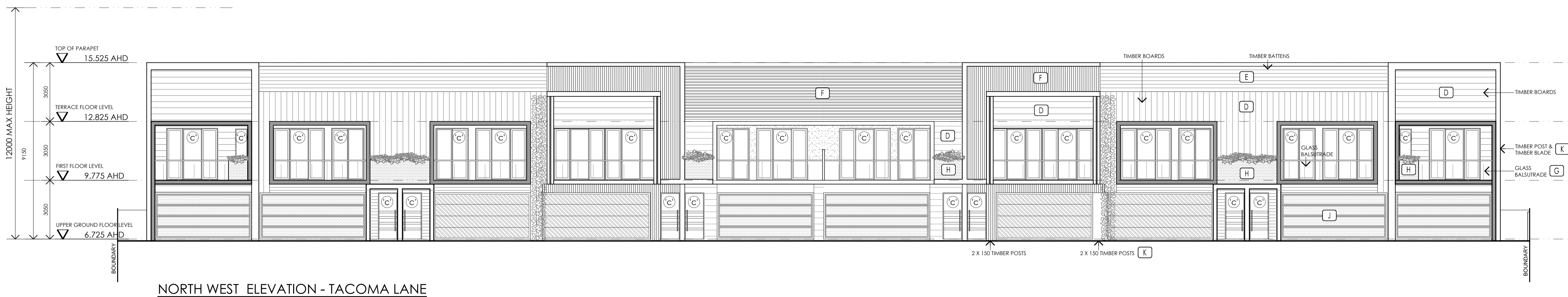
NORTH WEST ELEVATION - TACOMA LANE

AMENDMENT A: 10th FEB 2015 1. "C" 10 MM GLASS + SEAL IN COM. FRAMES TO ALL WINDOWS + DOORS SHOWN.