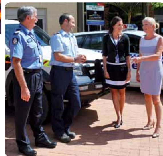
Youth services, major projects, waste services and community safety are just some of the areas that the City of Wanneroo delivers.