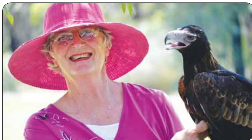
Local resident enjoying one of the many activities on offer by the City of Wanneroo.

Services for ageing residents Monday to Wednesday and Friday 9.30am-3pm.