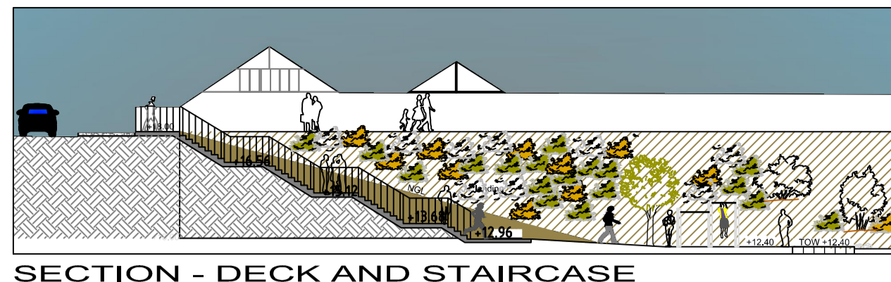
SECTION - DECK AND STAIRCASE