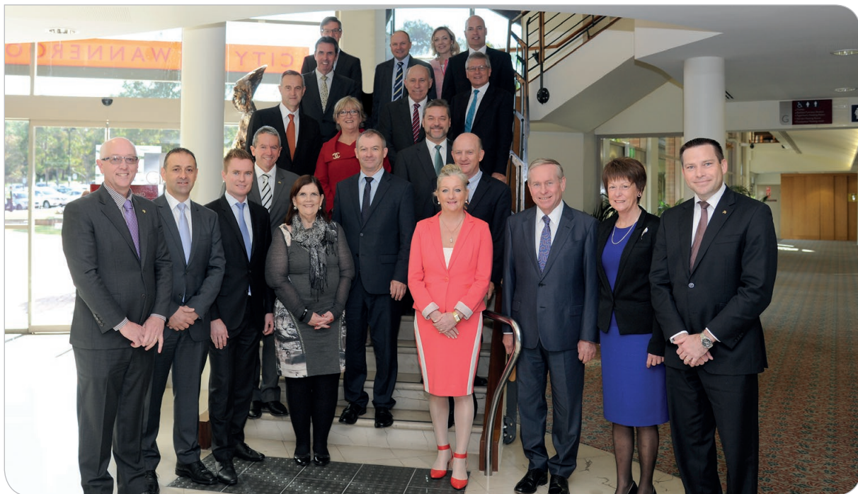
Premier and Cabinet at Wanneroo.

The most important thing the government needs to do for this area is to finally provide certainty for residents about their future. Current designation of the area as 'potential urban' under the East Wanneroo Structure Plan does not offer that certainty. It will only be provided once the area is rezoned under the Metropolitan Region Scheme.