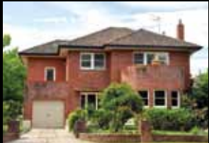
Waterfall (Art Deco) Homes