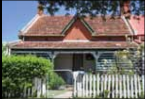
Colonial Pyramid Semi-Detached