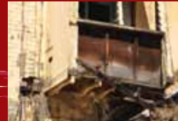
Falling down outhouses