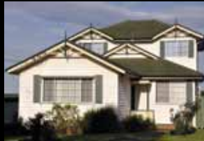
Suburban Weatherboard Home