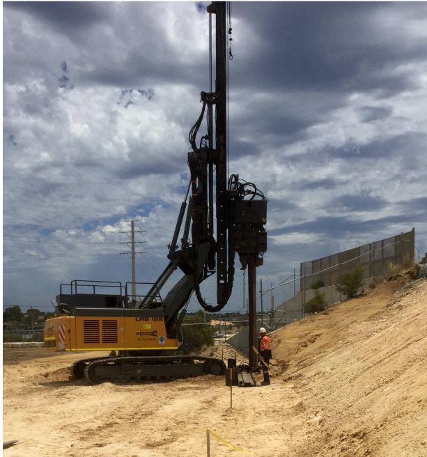
Install sheet piling to support the existing Hester Avenue bridge during construction.