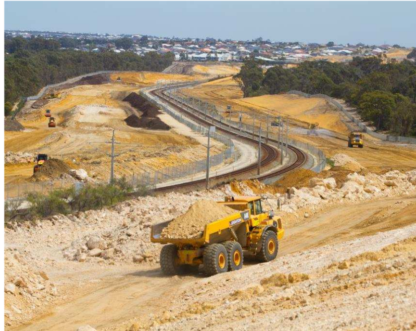
Looking north from Kinross - Major earthworks will continue across the project site until mid-year.