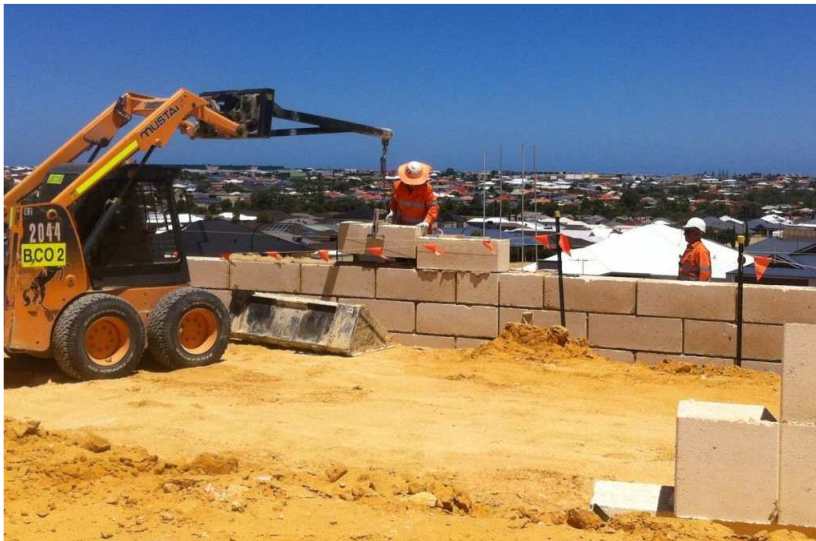
Noise wall construction underway adjacent Liberty Drive, Clarkson.