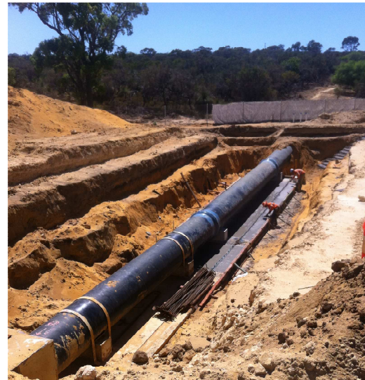
Works to protect the water main near Kinross continue.