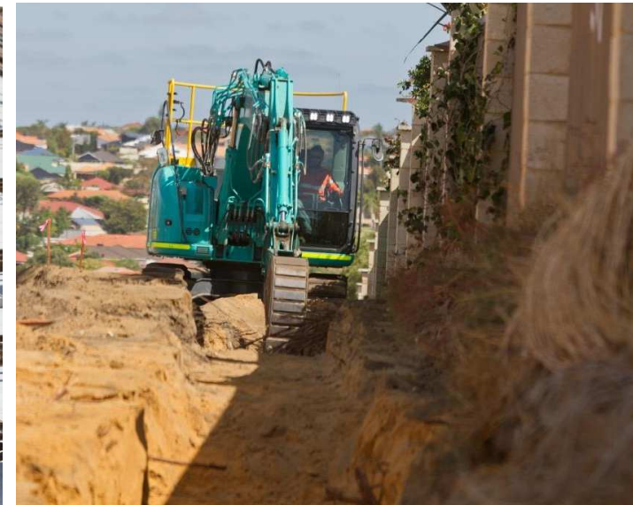
Excavation of the noise wall footings are progressing in Kinross.

*While every effort is made to ensure accuracy of information presented in this update, the details are subject to change.