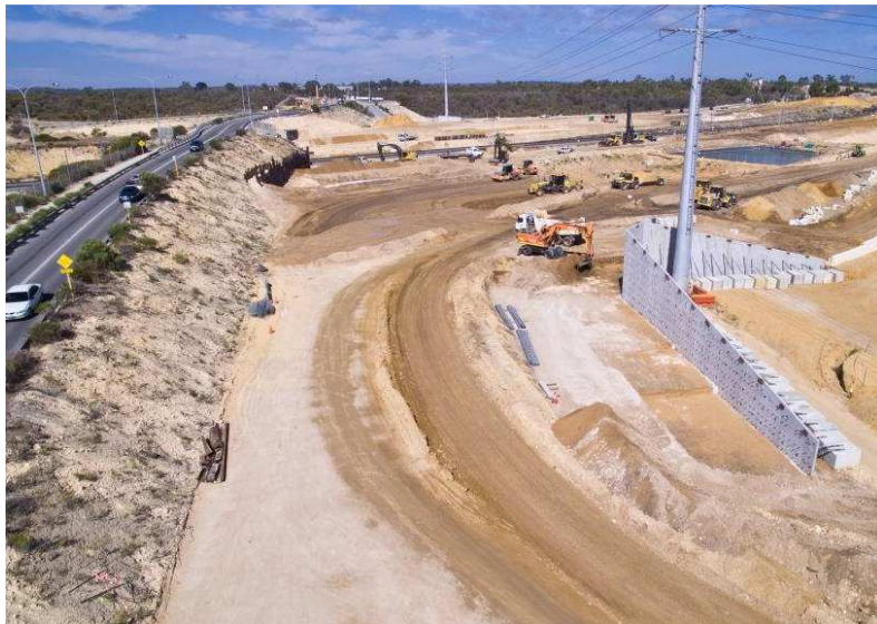
Works are in full swing to install the new bridge at Hester Avenue.

Change traffic conditions are in place throughout the project area, including speed restrictions and lanes closures. Signage will be place to through the works and we ask road user to follow all traffic management in place.