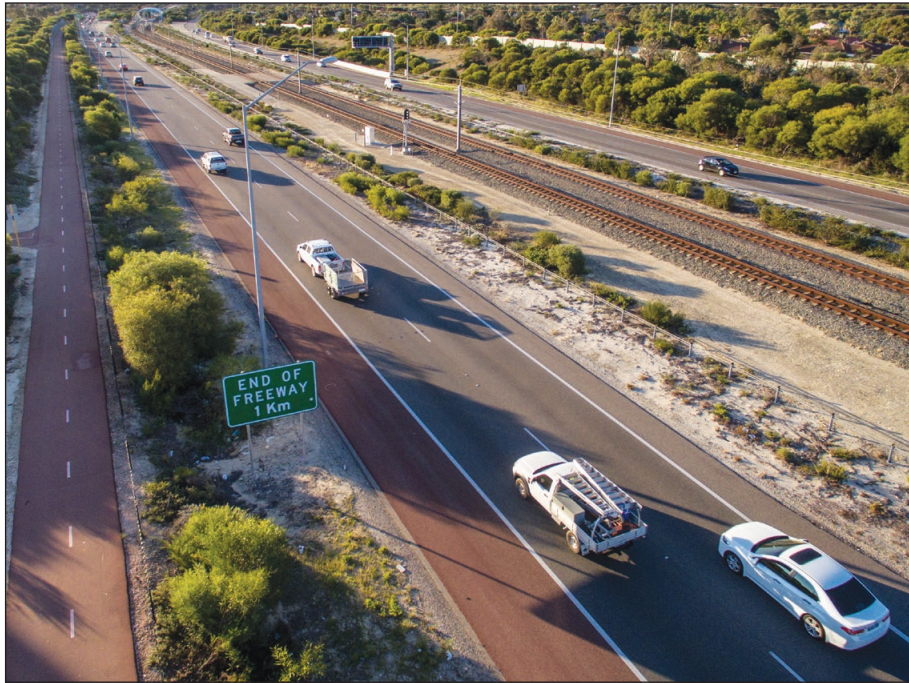
The Mitchell Freeway needs to be extended to Romeo Road.

The state government's recently announced Perth transport plan has left the City of Wanneroo disappointed because the plan lacks clear delivery timeframes.