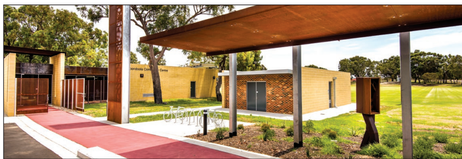
The 'peace park' will be located near the Koondoola Community Centre.

A shortlist of ideas will be put forward for public comment in due course.