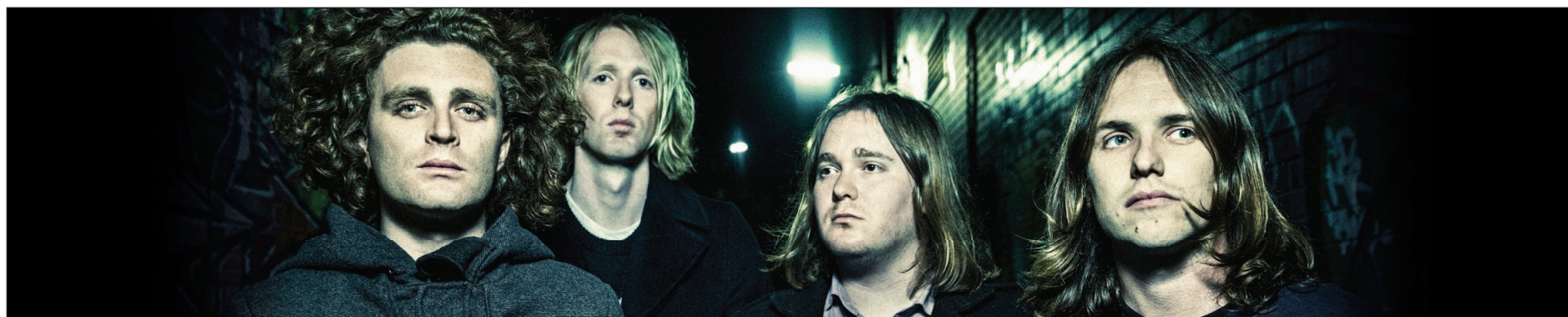
Chart topping Melbourne-based indie rock band British India will headline the annual City of Wanneroo Presents Concert on 5 November.

British India is one of Australia's best known bands, with four ARIA Top 10 Albums and 16 single releases. They have performed at every major festival across the country and each year continue to sell out their high-octane shows and produce exciting new music.