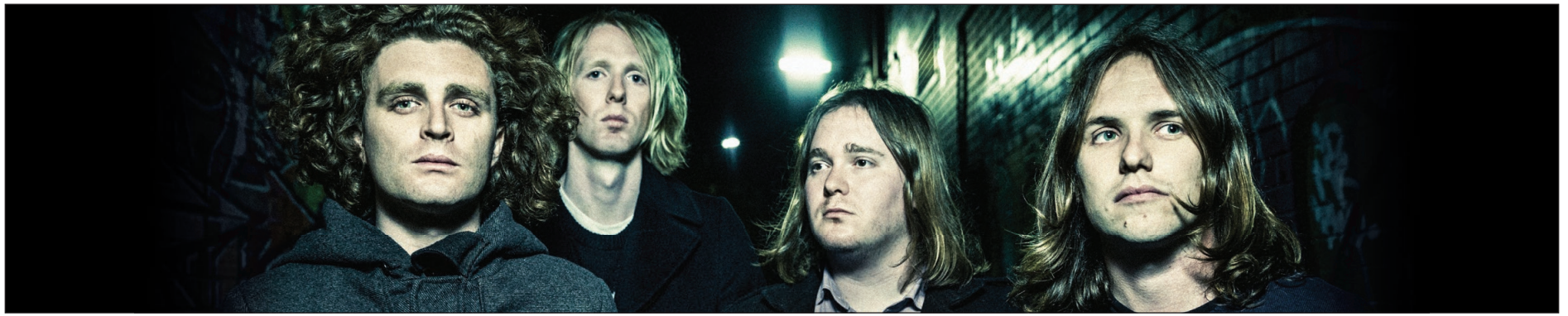
Chart topping Melbourne-based indie rock band British India will headline the annual City of Wanneroo Presents Concert on 5 November.

British India is one of Australia's best known bands, with four ARIA Top 10 Albums and 16 single releases. They have performed at every major festival across the country and each year continue to sell out their high-octane shows and produce exciting new music.