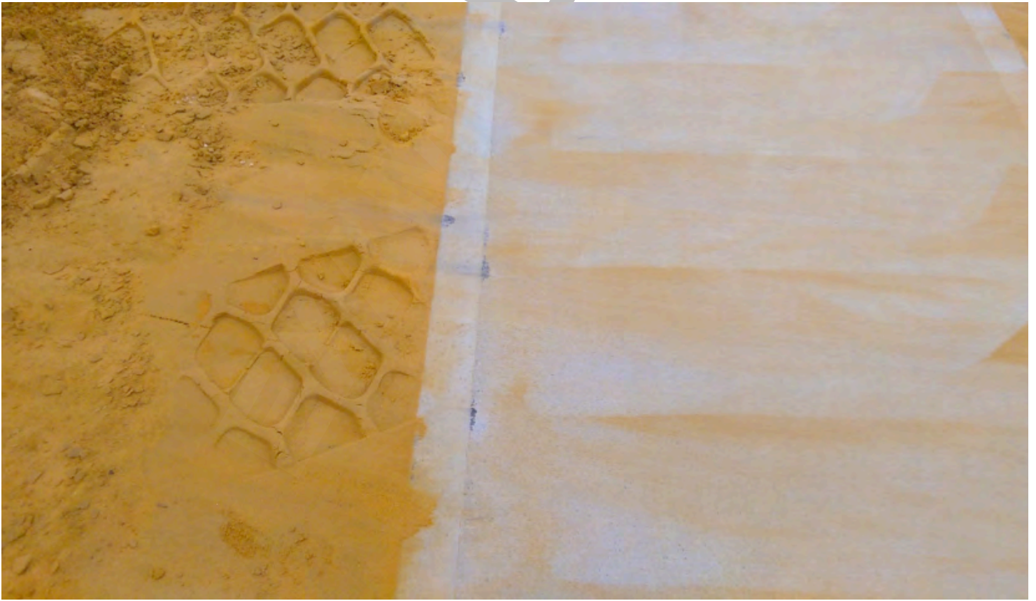
P1 COMMENTS: Close-up of P1 damage