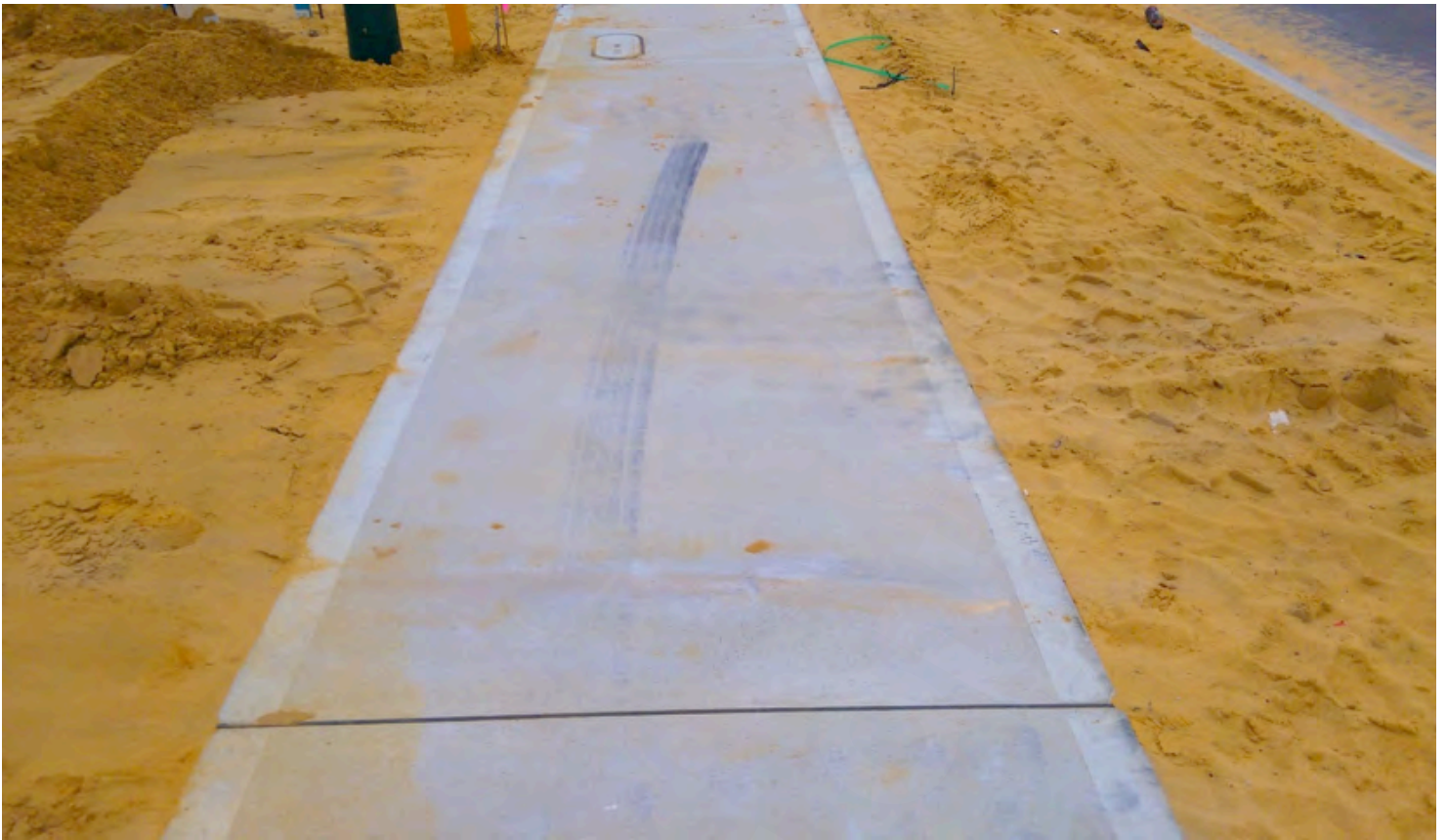
P2 COMMENTS: Minor chipping and tyre damage/staining to panel