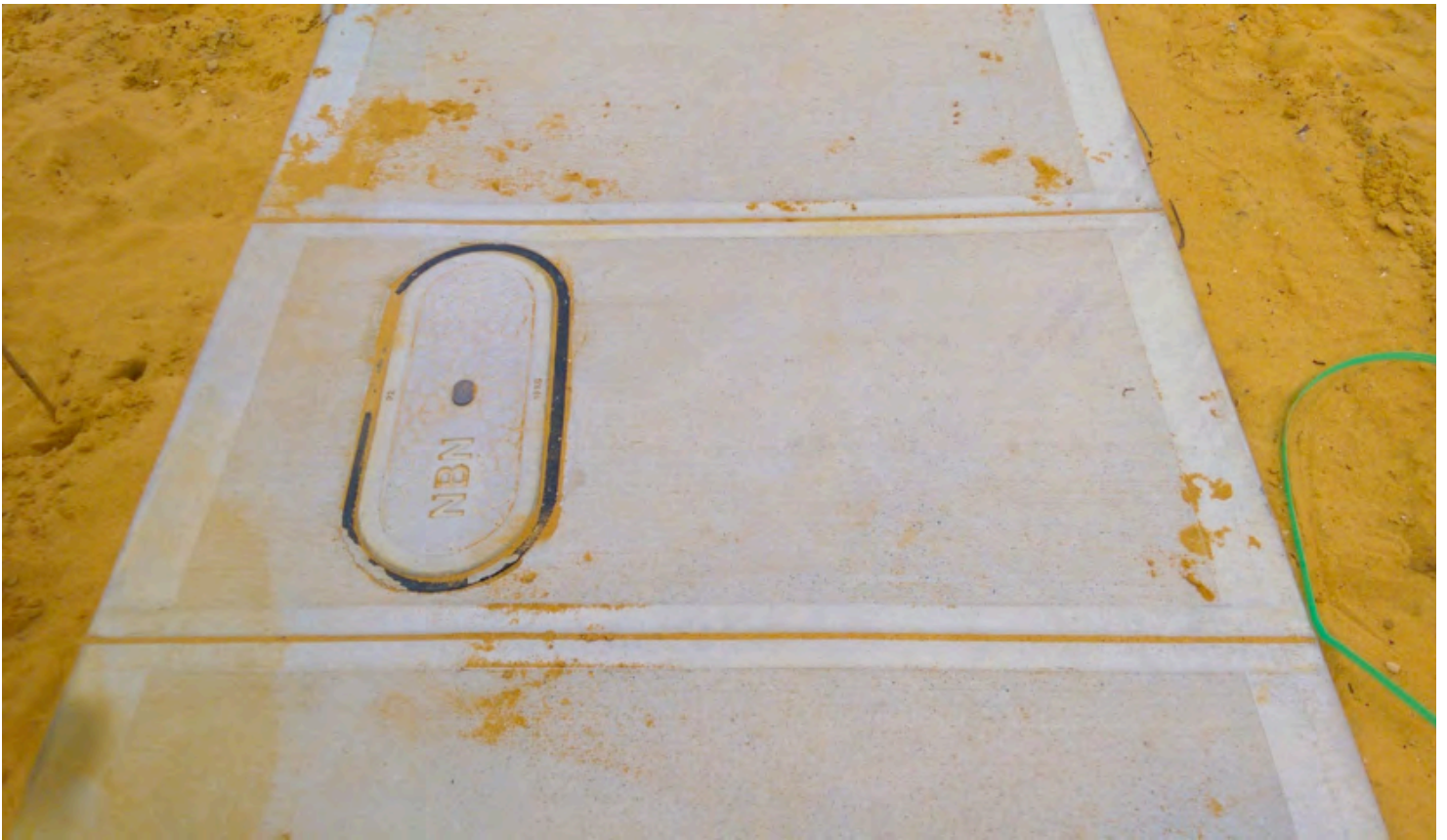
COMMON PANEL P1 COMMENTS: No damage to panel identified