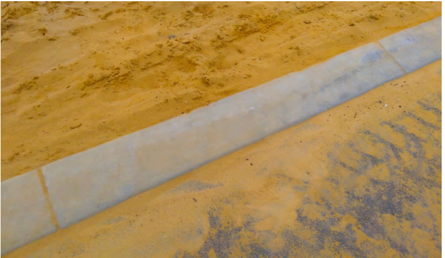
K4 COMMENTS: No damage identified