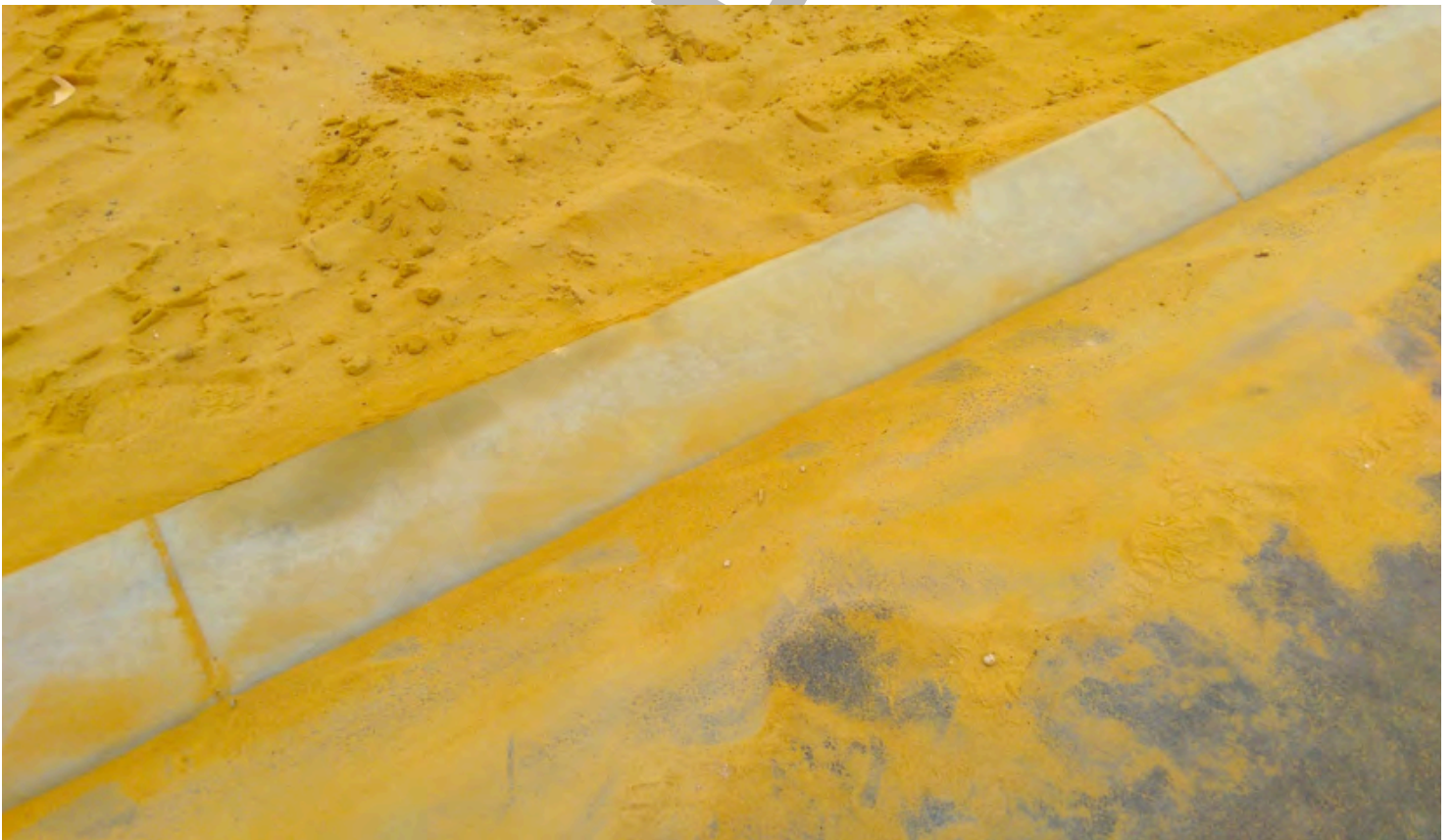
K3 COMMENTS: No damage identified