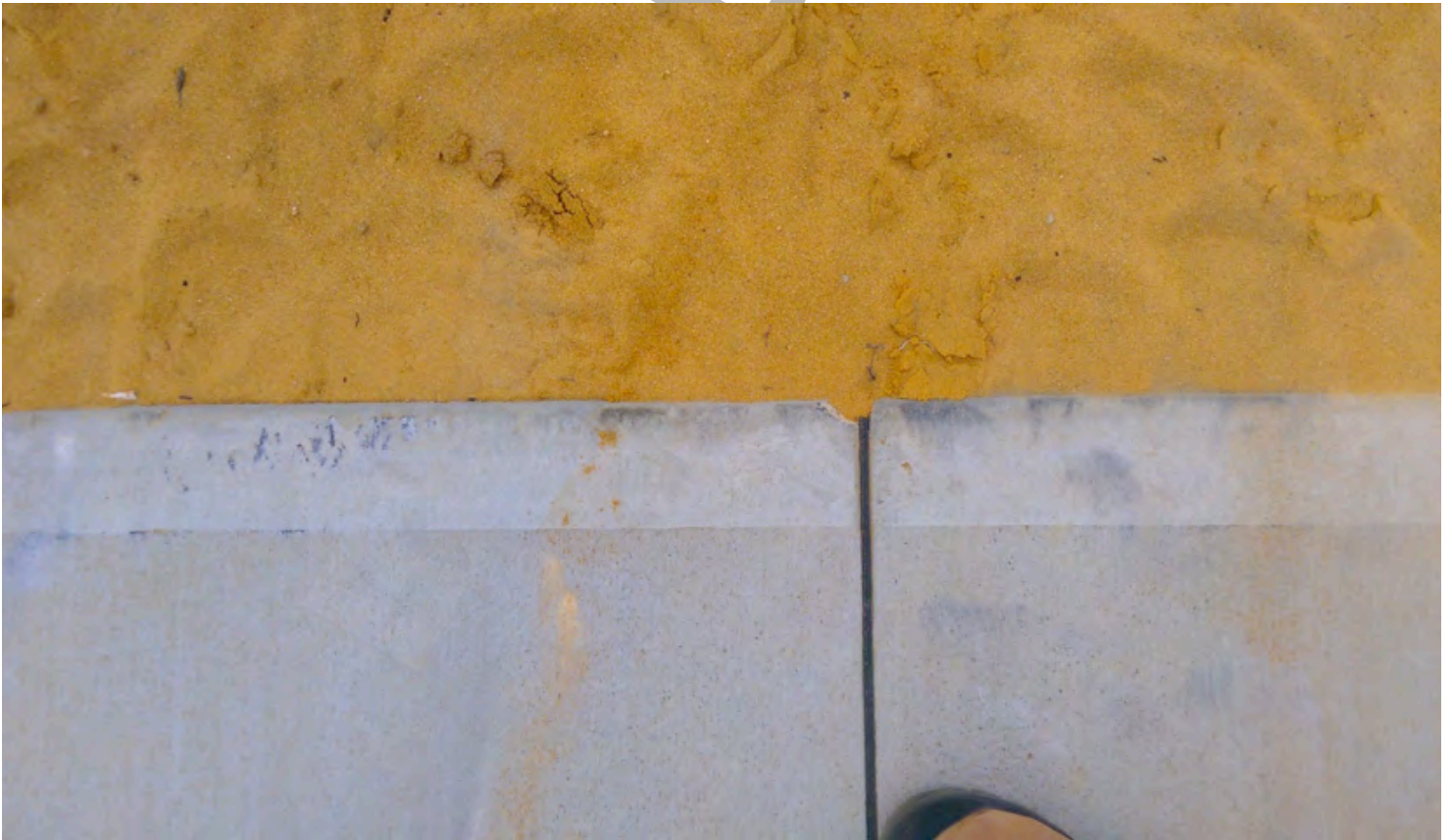
COMMENTS: Close-up of P2 damage