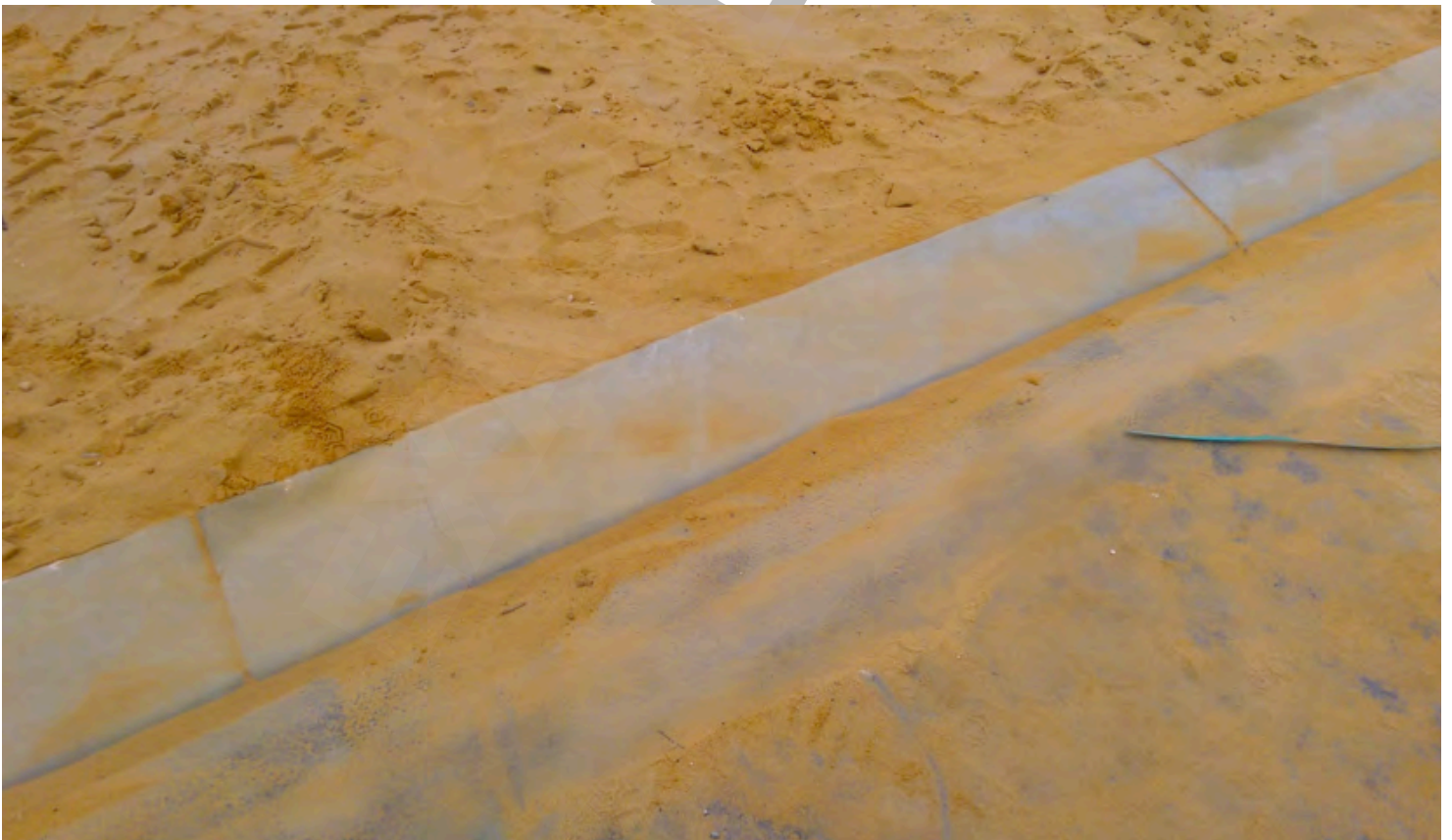
K2 COMMENTS: Cracking damage to kerb