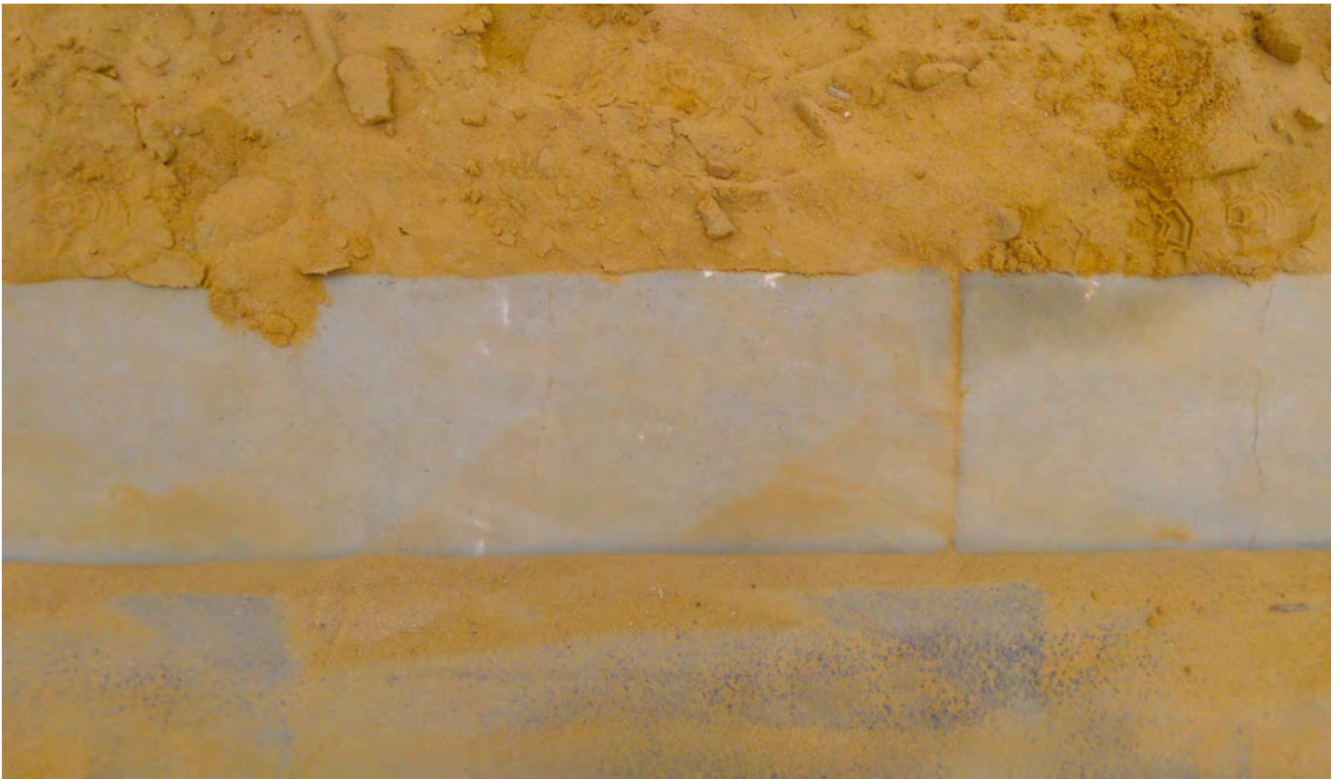
K1 COMMENTS: Close-up of K1 damage