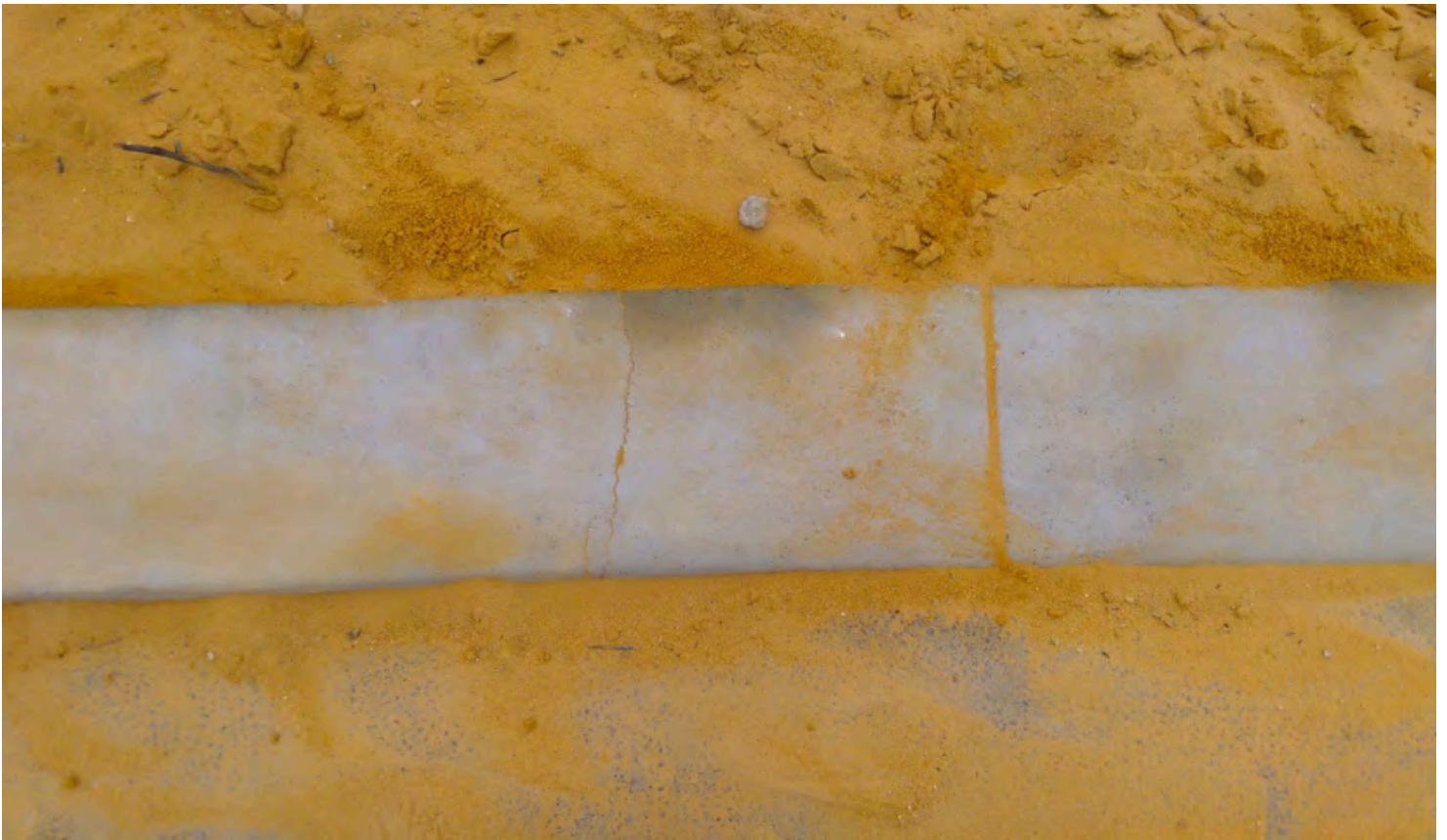
K1 COMMENTS: Close-up of common kerb 1 damage