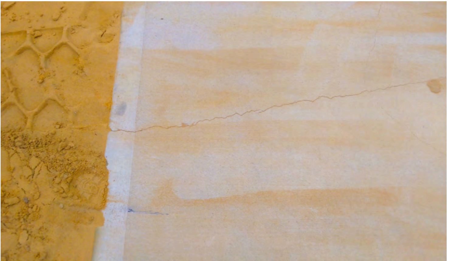
P1 COMMENTS: Close-up of P1 damage