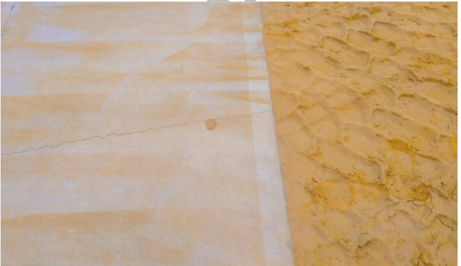
P1 COMMENTS: Close-up of P1 damage