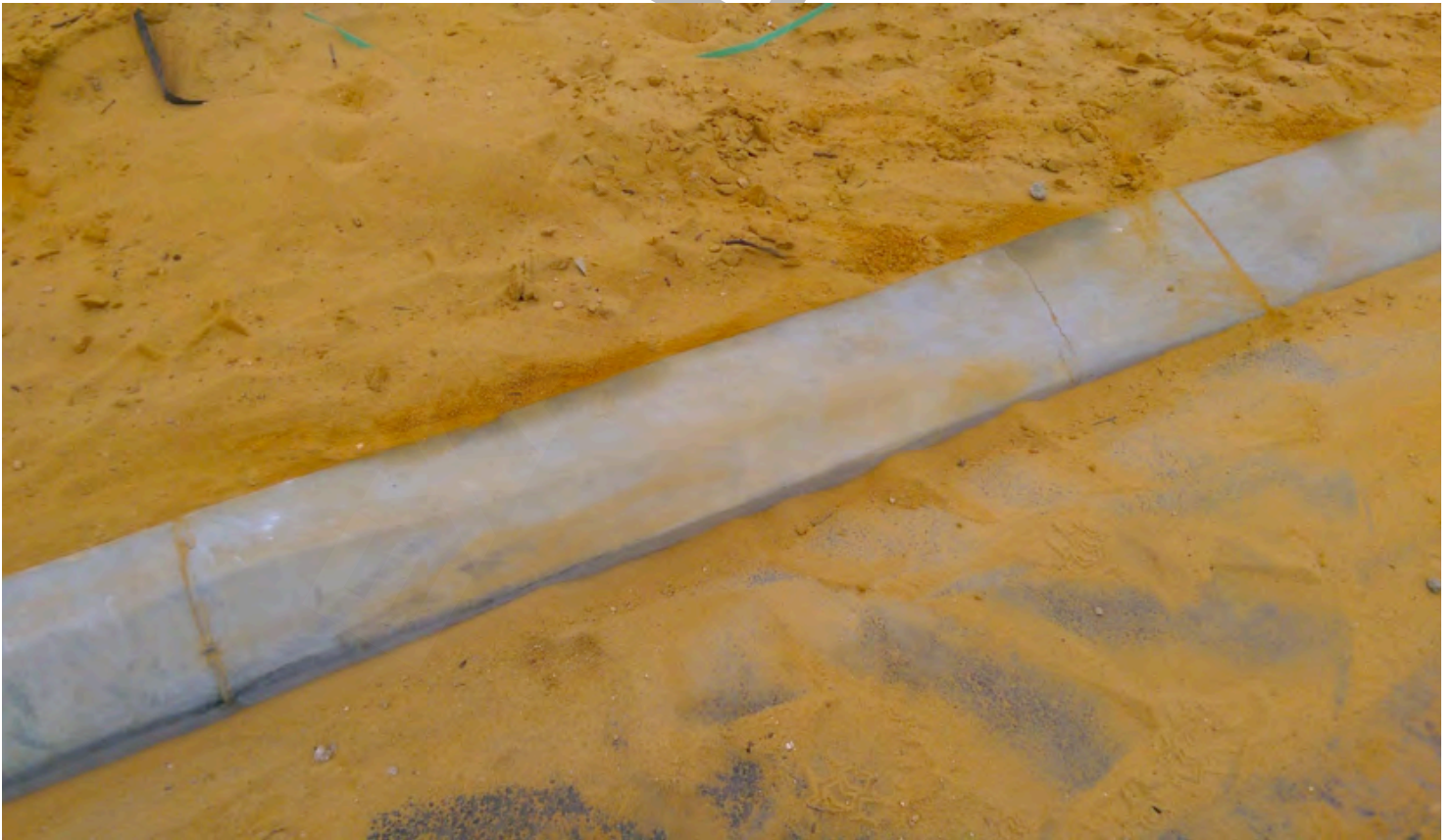
COMMON KERB 1 COMMENTS: Cracking damage to transitional kerb