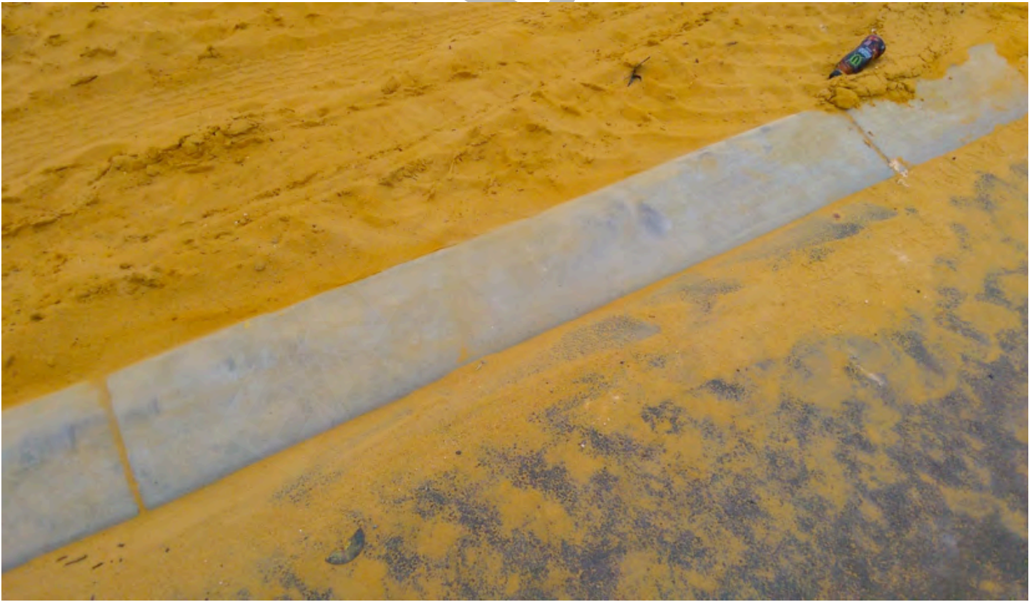
K5 COMMENTS: No damage identified