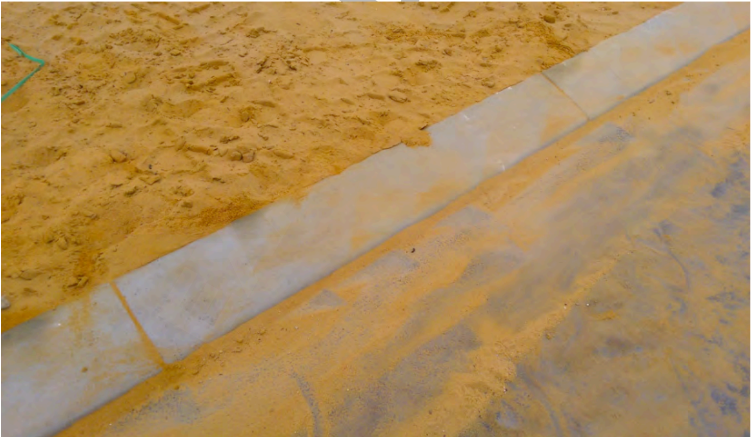
K1 COMMENTS: Shrinkage cracking to kerb