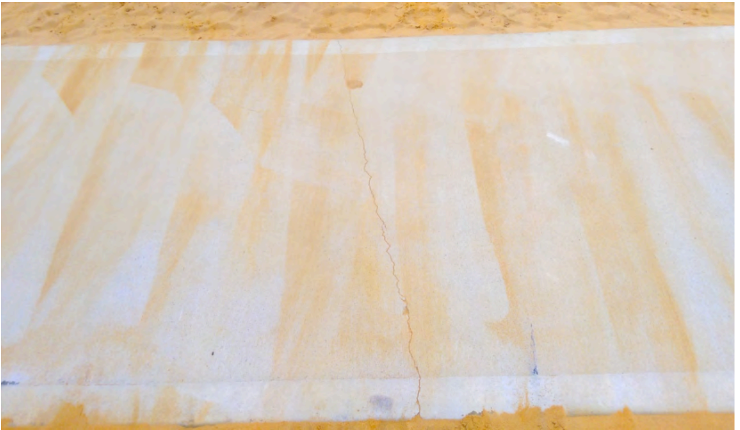
P1 COMMENTS: Close-up of P1 damage