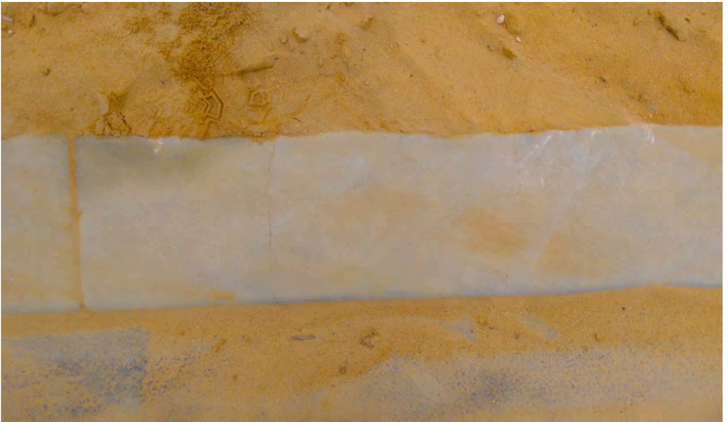
K2 COMMENTS: Close-up of K2 damage