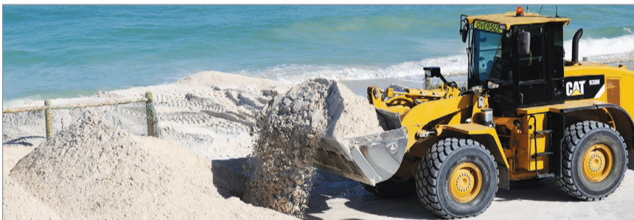
Coastal protection works are a feature of the 2017/18 capital works program.

Some of the biggest spending in the $70 million capital works program is for new and upgraded community buildings ($4.6m), sporting facilities ($17.4m), road works ($9.3m) and coastal foreshore management ($3.7m), all catering for our existing and growing communities.