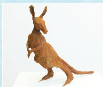
Sculpture - Leesa Padgett, Jump Start