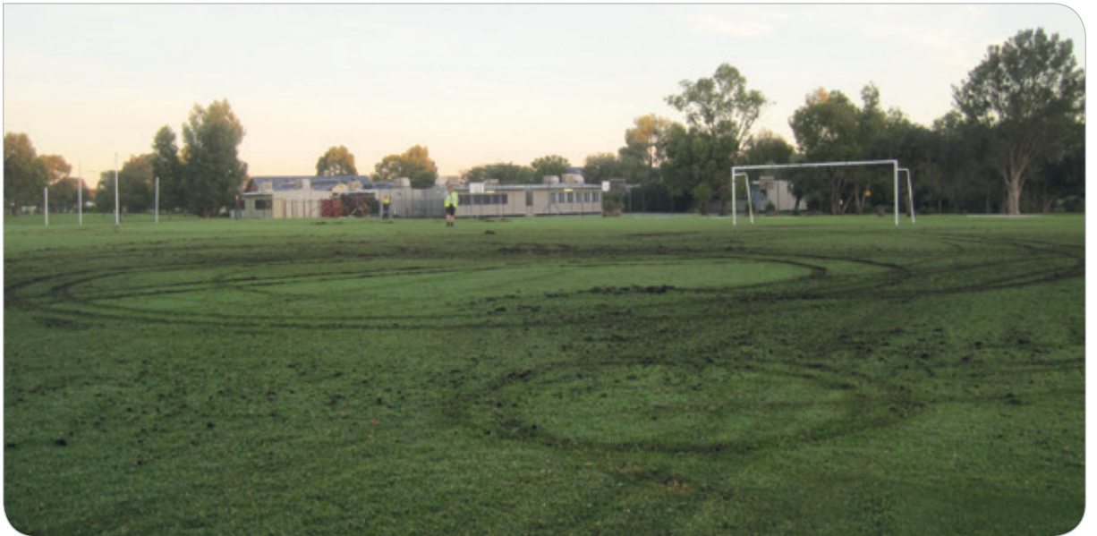
Recent damage to Houghton Park in Carramar meant it was out of action for local sporting clubs.

The City of Wanneroo is a great place to grow up in and live. With such a great coastline and a rich cultural heritage, why would you choose to live anywhere else?