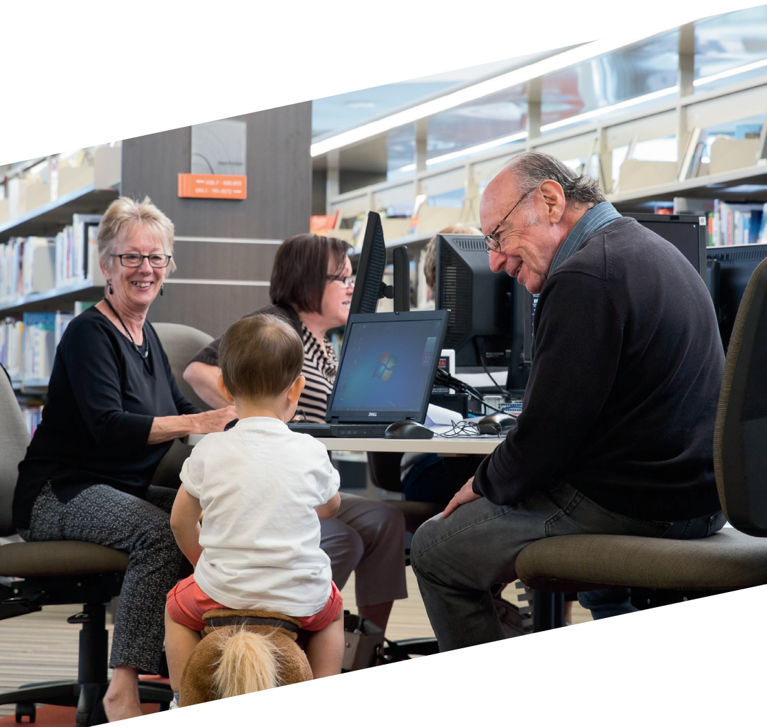
City of Wanneroo Annual Report Highlights 2016/17