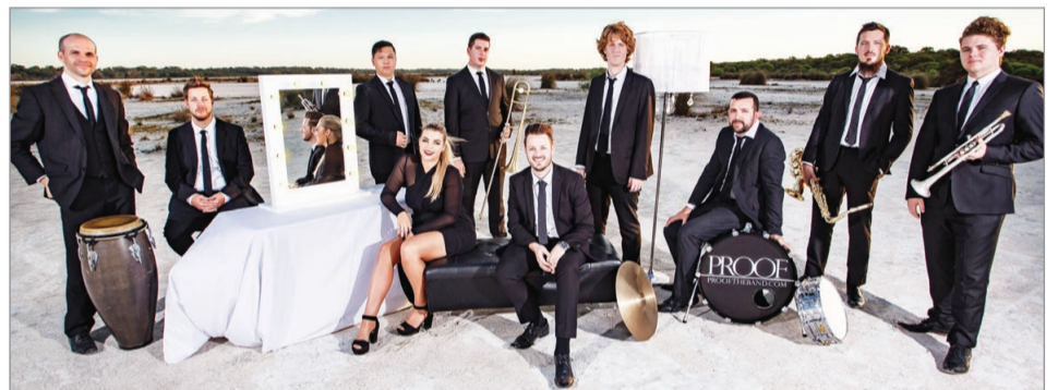
Perth's premier ten-piece band PROOF will be headlining the City of Wanneroo's Retro Rewind event.

Free children's activities include classic arcade games, vintage lawn games, a bouncy castle, face painting and much more.