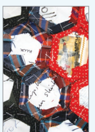
Trish Little, I like the other side. (Detail)

Artists have come together to exhibit textiles, jewellery and photography alongside artefacts and samples that give insight into their inspiration.